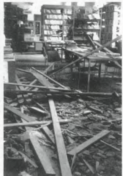
The "Grad" Public Library in Dubrovnik, which dates back to the 16th century, was badly damaged several times by shelling.

cal events. Suggested retail price is $99.00. For more information, contact Microsoft Corporation, One Microsoft Way, Redmond, WA 98052-6399.