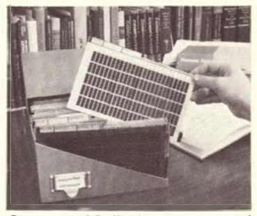
Over 1,100 LC Entries are contained on a single Microfiche card . . . millions compressed into a desk-top 20inch Microfiche file.

Printer. Just six seconds later you have a full-size LC copy.