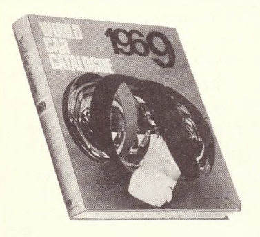
"Superb"—New York Times

THE DEFINITIVE REFERENCE covering every 1969 car model, U.S. and foreign. One full page of technical data with two pictures is devoted to each car. Unique sections on prototypes, special bodies and the world's car manufacturers. Superbly organized with four analytical indexes.