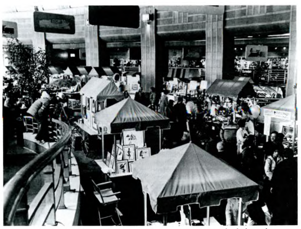
Crowds explore the shopping opportunities at Cincinnati's Union Terminal, which was the most elaborate and expensive train depot in the world.