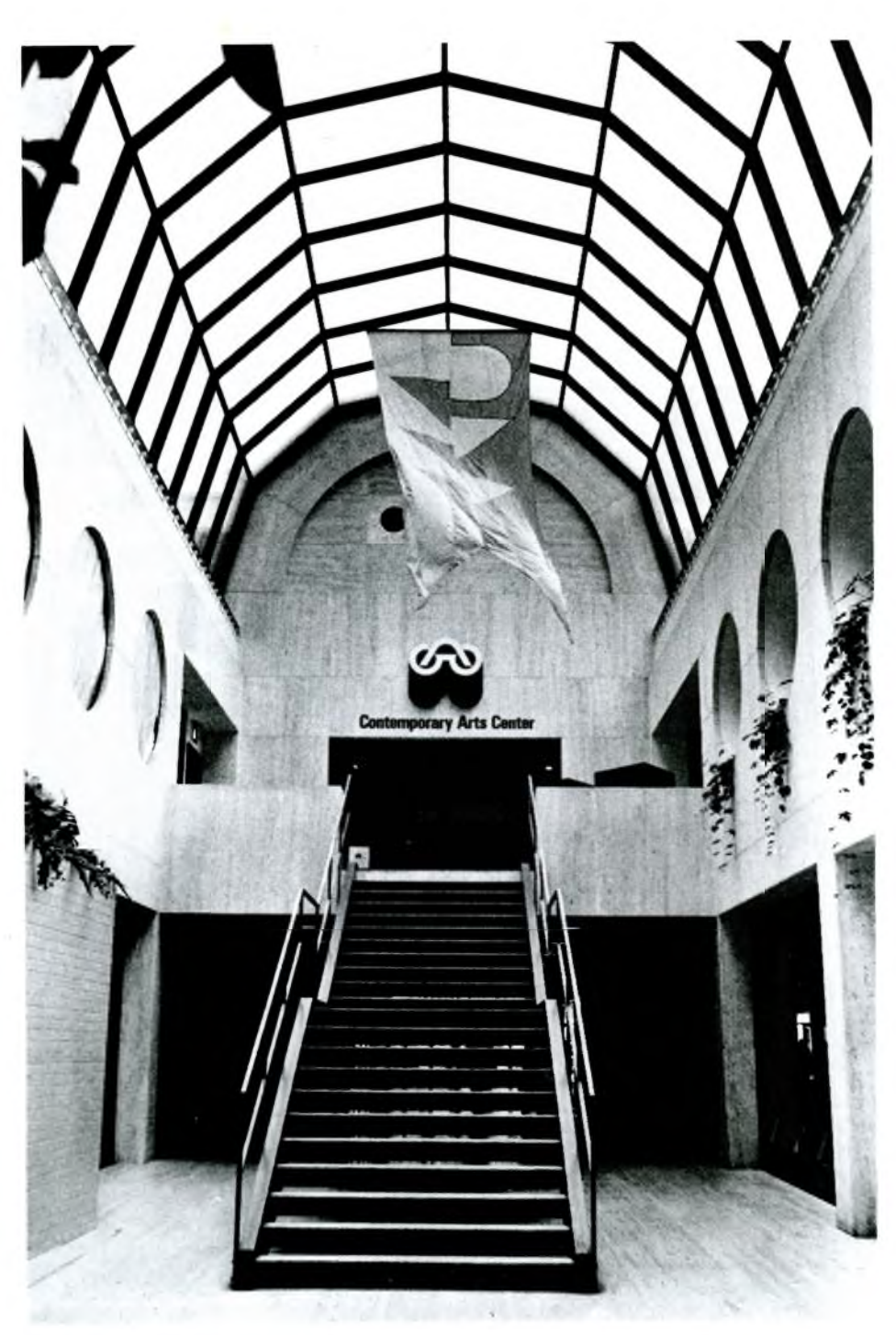
The Cincinnati Contemporary Arts Center presents continually changing exhibitions of recent art—from paintings, sculpture, photography, and architecture to multi-media installation, experimental, conceptual and video art, plus tours, concerts, films.