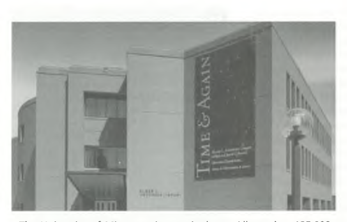
The University of Minnesota's new Andersen Library is a 185,000 square foot facility that features two storage caverns, mined from sandstone in the bluffs of the Mississippi River.

The University of Minnesota opened to the public the Elmer L. Andersen Library, named for the governor. A unique feature of the 185,000 square-foot facility situated on the bluffs of the Mississippi River, is its two storage caverns, mined from the sandstone in the bluffs. Each cavern measures 600 feet long, 65 feet wide, and 23 feet high. The caverns, in which archives are kept in optimal conditions (62 degrees F. and 50 percent relative