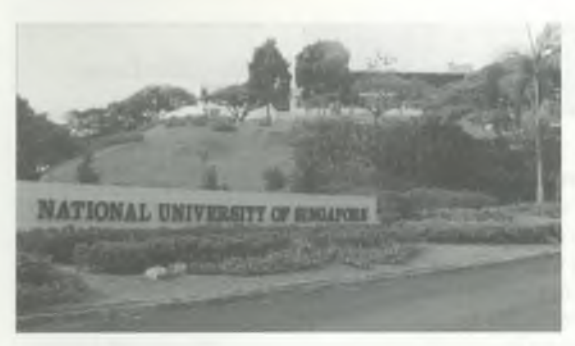
The National University of Singapore Library is implementing 3M's digital identification technology.

The 3M digital system tracks library materials by a "smart label tag" affixed to each item. Each tag includes a tiny antennae and microprocessor chip that contains information unique to the item it marks. The tags will be decoded via radio frequency waves so that items can be tracked as they enter, move about, and exit the library with patrons. The digital system will automate tracking lost items and taking inventory and minimize unauthorized removal of library materials as it provides for patron checkout that integrates magnetic security with detection systems located at the exits/entrances to the libraries.