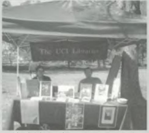
With a bright new banner to attract attention to their exhibit, library staff are ready to greet the next visitor.

Through tours of the libraries, demonstrations of computerized library systems, a book sale, and an information booth prominently situated amongst those representing a diverse cross section