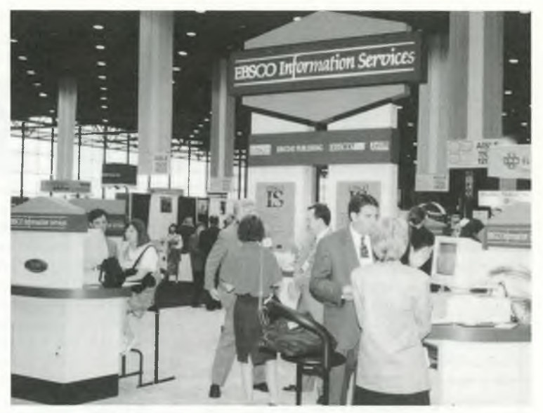
Over 5,500 librarians requested exhibits-only passes to check out the latest products and services displayed at the ALA Annual Conference in June.

pered with humorous asides on Washington politics, was that the era of the information intermediary is not over. and, indeed, that the need is greater than ever for intermediaries who can help make sense of the flood of information inundating the end user. Information companies like Congressional Ouarterly. he asserted, will survive and prosper not by flooding the end user with more information, but by presenting information fairly and accurately. He noted that