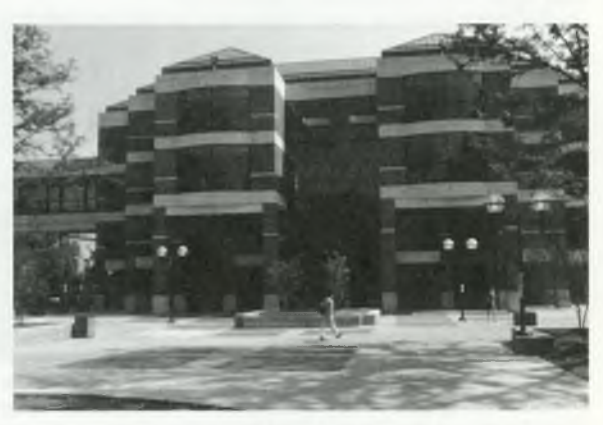
The newly renovated Shapiro Undergraduate Library at the University of Michigan, Ann Arbor.

tional 30,000 square feet, new workstations providing World Wide Web access to the Internet. and a multimedia collection of information resources for undergraduate study, including the Core Journal Project which gives undergraduates access to a full-text digital library of key journal literature. The new library also includes an Academic Resource Center for instruction and consultation with campus academic support groups, a reading room of required courserelated texts, 13 small group study rooms equipped with ethernet connectivity, individual study seating for 750, with classroom and microcomputer facilities providing 100 additional spaces. The library also houses the newly unified science library collections which include more than 300,000 volumes.