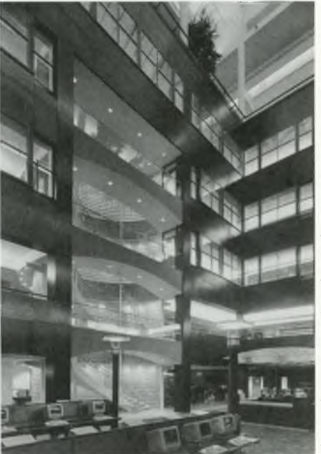
The interior of the new Campus Library and Technology Center at Baruch College in New York City.

The new Baruch College Campus Library and Technology Center was awarded the Municipal Art Society of New York's Certificate of Merit and an AIA/ALA Library Building Award in June. Using the 1894 Metropolitan Street Railway Company of New York building, the architectural firm of Davis, Brody & Associates gracefully integrated classic design with new technology.