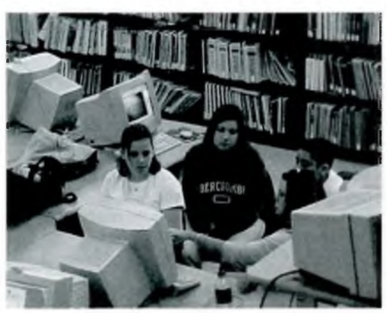
Students from a local middle school discuss their project findings as part of their collaborative computer work in the Saemann Resources Center.

We have found these trips to the Carthage campus to be invaluable learning experiences