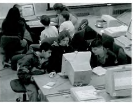
Two groups of local middle school students explore the Internet and discuss the results as part of their collaborative projects in the Saemann Center of Ruthrauff Library at Carthage.

implementing, and evaluating technology-enriched instructional projects in the local schools.