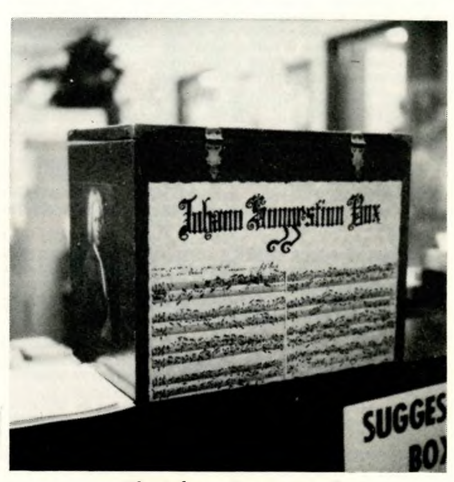
The Johann Suggestion Box.

Some of the queries are answered in verse or dialogue and all contain a fair amount of musical puns. Ever since the box was made available, student-staff relations at the library have been very chordial.