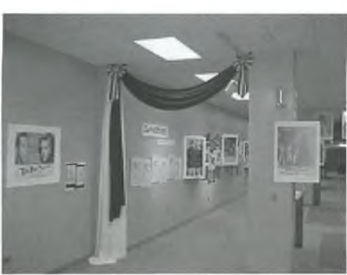
Replicating the feeling of a movie theater lobby, the main entrance to a film-themed exhibit invites the patron to explore. Physically altering an exhibit space helps create a mood and enhances the impact of the exhibit.

businesses generate the greatest volume of service and usage. many times it is the special exhibit that creates excitement. The exhibit may get coverage in a local newspaper, though only a few hundred come to see it. The thousands of books added or hundreds of classes taught, while central to your mission, seldom generate the publicity, buzz, or recognition.