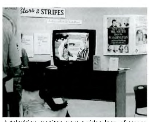
A television monitor plays a video loop of scenes evoking the era in the same film-themed exhibit. The moving images and sounds help to further enhance the viewers' experience in what otherwise may be a

While none of us are ready to subcontract as exhibit designers, we feel that, ready or not, through study, trial and error and mutual support we have all raised our professional abilities in the area of exhibit design, preparation, and management. We may have been surprised by our new roles, but we feel that the increasing emphasis on library exhibits is a vital part of our service mission.