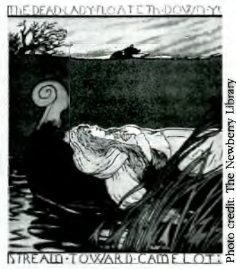
An illustration by Howard Pyle for the book The Lady of Shalott by Alfred Lord Tennyson (New York, 1881).