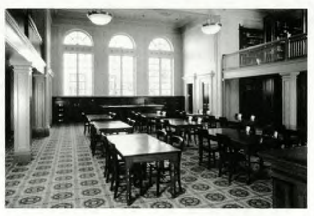
The Historic New Orleans Collection's Louisiana photographs, manuscripts and slides are available at the Williams Research Center which includes this lovely reading room.

ALA's New Members Round Table is sponsoring a mentor program to help new conference attendees make the most of the opportunities to learn, network, and participate at ALA's conference. If you would like to feel more comfortable attending conference or if you are a seasoned conferencegoer who would like to share your knowledge and experience by helping someone negotiate a path among the many meetings, programs, exhibits, and acronyms, the Conference Mentor Program wants to hear from you. Mentors should plan to meet with