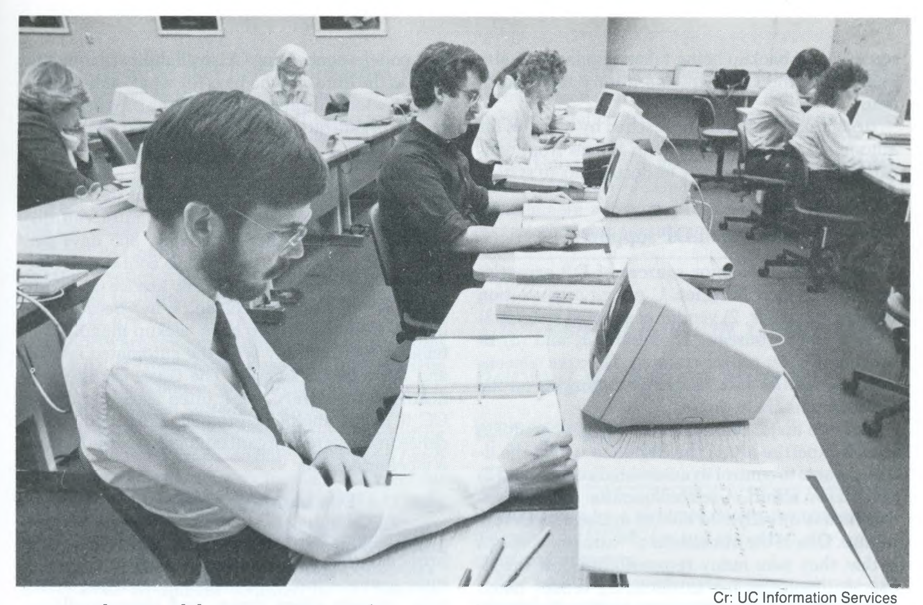
Library and data processing staff being trained for BLIS by Biblio-Techniques instructors.

hardware upgrades reported by Boss and McQueen.<sup>1</sup> Those upgrades apparently were due to "lowballing" estimates of customer disk storage and CPU requirements in order to secure the contract.