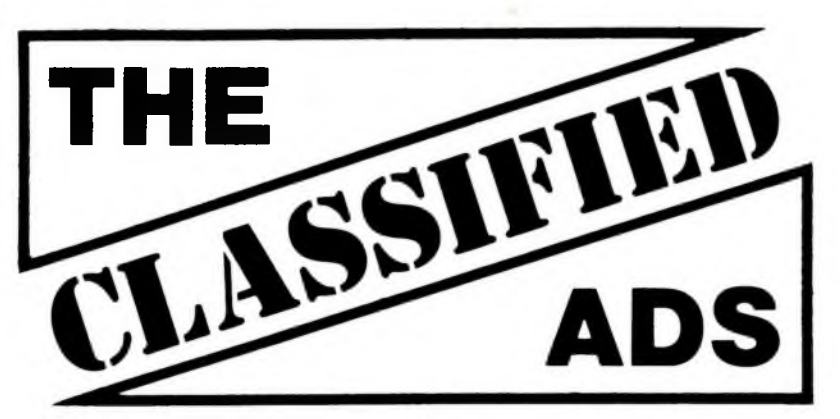
Deadlines: Orders for regular classified advertisements must reach the ACRL office on or before the second of the month preceding publication of the issue (e.g. September 2 for the October issue). Late job listings will be accepted on a space-available basis after the second of the month.

1-4—Management: Analytical Skills Institute, sponsored by the ARL Office of Management Studies, Honolulu. This program focuses on the skills needed for sound analysis in the areas of operational problem-solving or project planning. Fee: $450. Contact: ARL/OMS, 1527 New Hampshire Ave., N.W., Washington, DC 20036; (202) 232-8656.