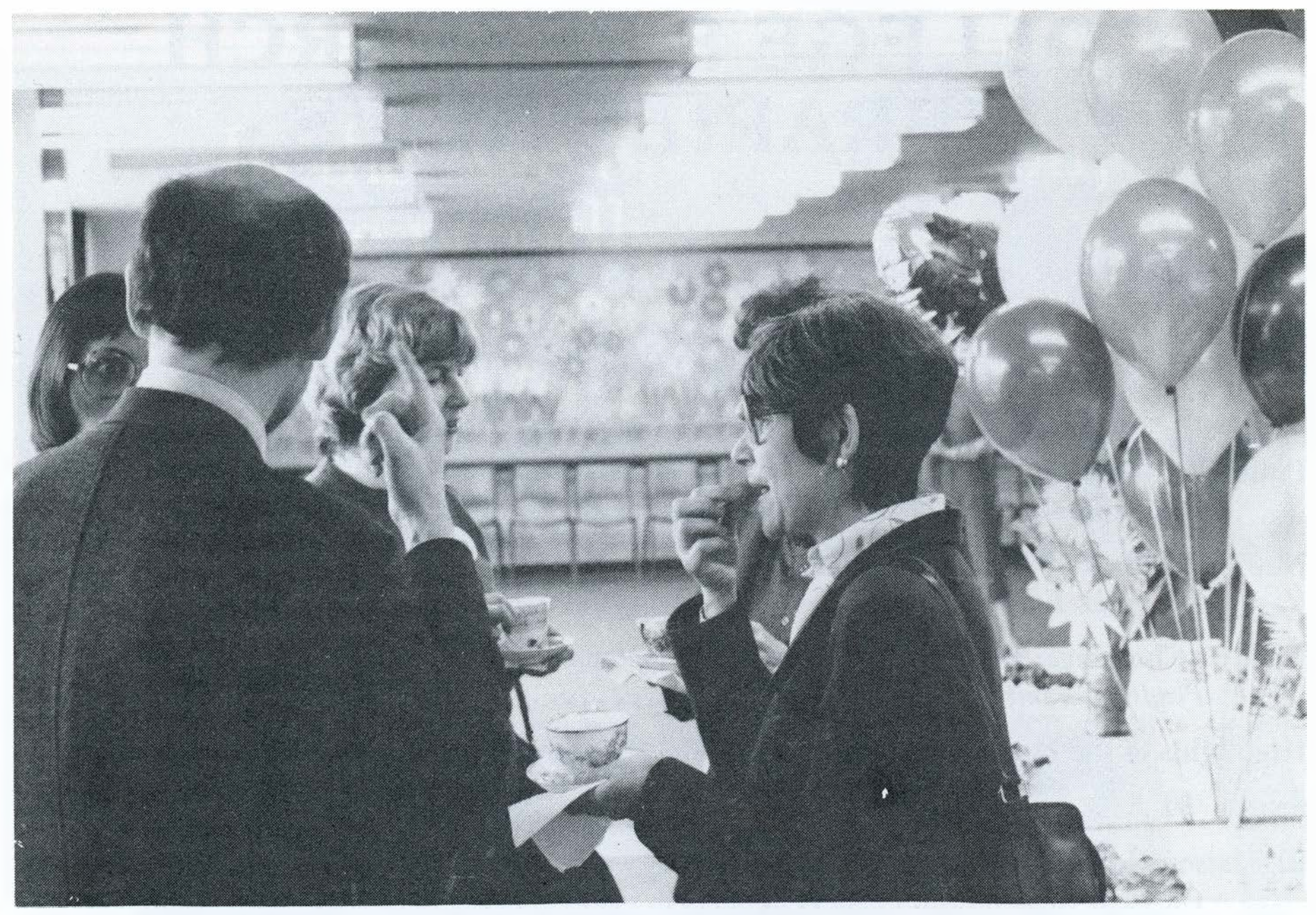
Library administrators at the University of Washington gave a party for the library staff, thanking them for their continued support in a period of continuing budget retrenchment. Economical decorations were balloons and paper cut-outs with a Spring motif, cut from old copies of library calendars.