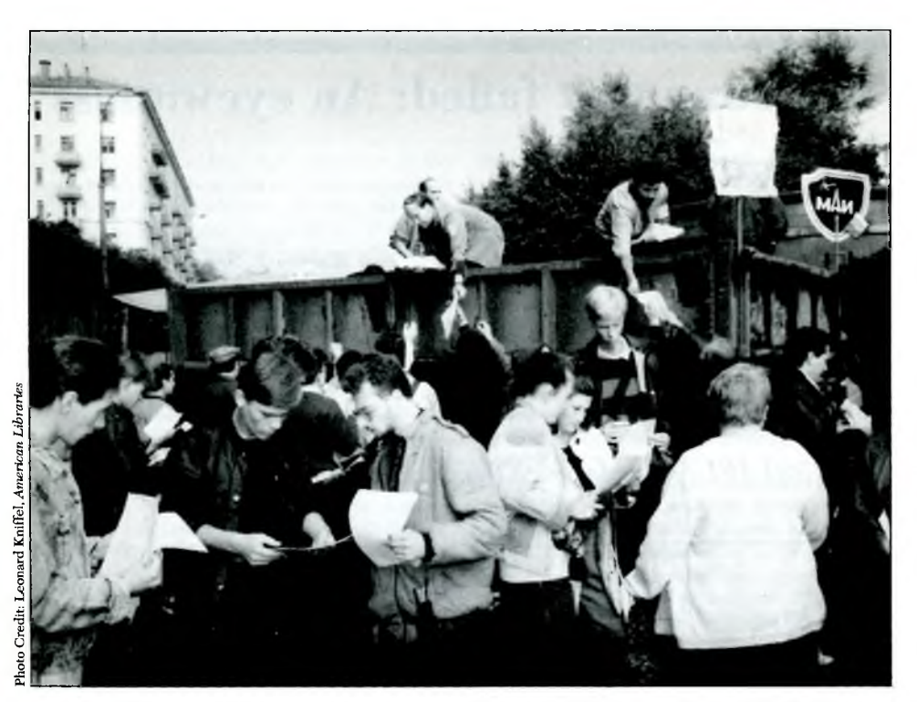
On Tuesday, August 20, Soviet citizens near the Parliament building anxiously reach for the latest handbill to learn about new developments in the coup attempt.

Russian, the coup leaders controlled the Moscow stations. On the radio nonstop music often replaced the normal news broadcasts. Even across the language barrier we were sure that we were listening to wake-up exercises on the second morning of the coup. I wondered how really isolated tourists found out about the crisis.