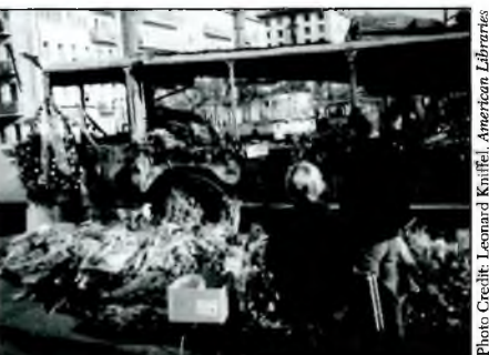
A memorial was made of the site where three young men died defending the barricade around the Parliament building in Moscow.

My wife and I had rented a Russian apartment toward the outskirts of Moscow where life went on