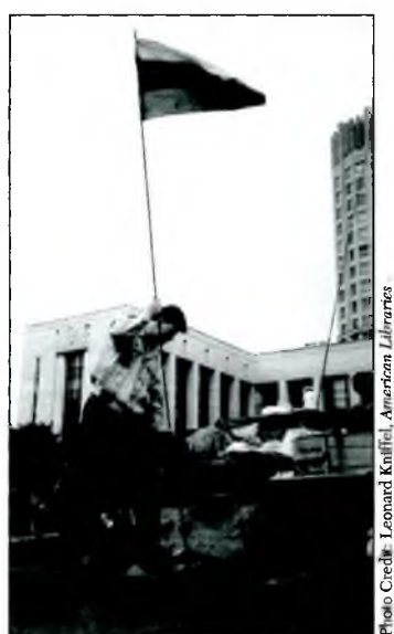
A young Russian plants the flag of the Russian Republic on a tank patrolling near the Parliament.

The opening ceremony proceeded with eerie normalcy. After the state-of-the-emergency announcement from Hans-Peter Geh, the predictable round of official speeches followed. The Min-