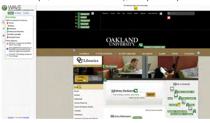
Screenshot of the WAVE browser extension. View this article online for detailed images.

to have a link in our subject guides for "iournals" if there is already a link for "iournals" that i s part of the main navigation for our site. In this case, it