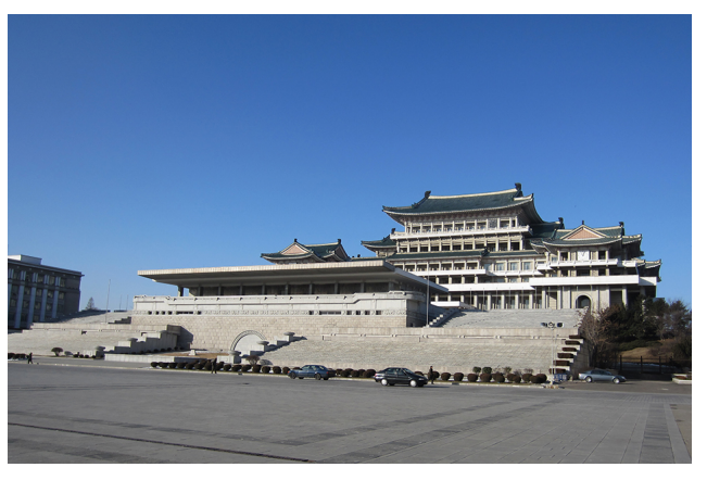
Grand People's Study House.

server: students could easily find recorded lectures categorized by the title. course number. and instructor of the course. The library offered media space where students could watch lectures with