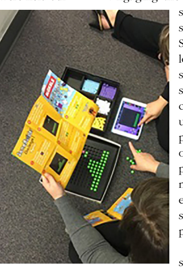
plored new technologies Figure 2. Exploring video game makduring the Fall semester of ing kit called Bloxels. thusiasm by the average

Engaging the students as cofacilitators situated them as early professional development leaders. Some volunteers provided lesson plan ideas, step-bystep instructions, and even suggestions for how it might connect to elementary curriculum. Volunteers and student participants mentioned this opportunity offered them experience learning about technology they did not know existed and mentioned possibilities to use later in their program and field.