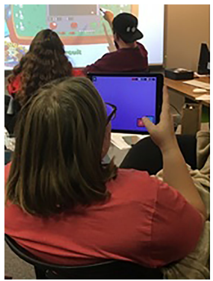
Figure 1. Library hosted workshops to introduce new technologies and applications.

The partnership between ETRC and ELED-LLC is a relationship aimed to create a space to enhance the learning experiences of first-year students. The ELED-LLC makerspace resembles a classroom and serves as a lab space for students to practice and experiment with teaching activities and content.2 The connection between the library and the residence hall is not new. In fact, residence hall libraries have been a staple on some campuses since they were implemented at Harvard in 1928.<sup>3</sup> The residence hall connection has been rediscovered as academic