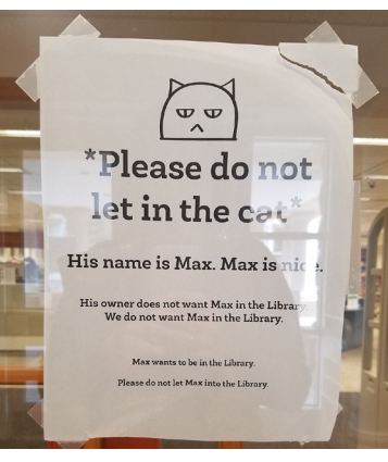
\label{eq:constraint} original \ \ \textbf{Handwritten sign and printed sign.} \ Photo \ credit: \ Rebecca \ S. \ Wingo, \ used \ with \ permission.

It took nearly three weeks for the photo