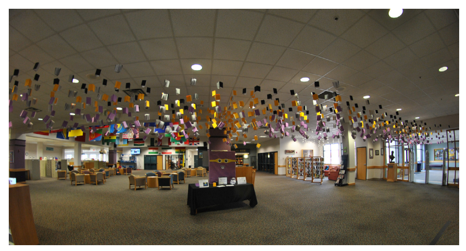
Installation at Miller Library from the East Door.

Assembling the books proved more complex than anticipated. After initial discussion, Gray and Jaquez determined it was best to glue the covers to the fishing line before gluing the interior pages. They created a sample strand of four books, using all three covers.