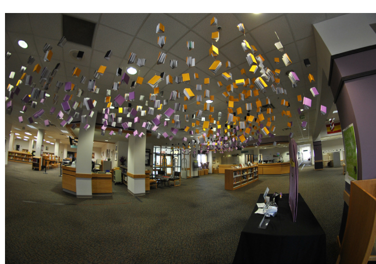
Installation at Miller Library from the North Door.

of formats. For instance, they considered featuring silhouettes of the university's mascot, the mustang. In the end, they settled on an origami book form as attractive and, of equal import, relatively simple to construct.