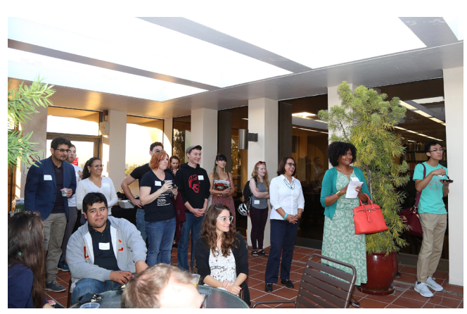
View of attendees at open house.

they worked together to throw an epic library open house for their liaison areas.