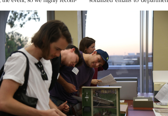
View of attendees interacting with special collections material.

beginning of fall quarter without being during orientation week, as this is already completely full for the incoming graduate students. Additional scheduling complexity came from SCA staff availability.