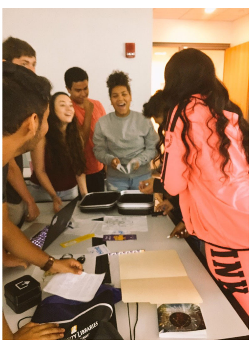
Figure 3. Students excitedly open the lock box to reveal the congratulatory message inside.

Within writing pedagogy, a tension exists between teaching writing with the intent that the skills will transfer and teaching writing as a way of thinking and being. The Breakout-EDU session reduced some of this tension. As students approach challenging writing and thinking tasks, they can refer back to their shared experiences and reflections. This will help them both with transferring knowledge, and with building their thinking.