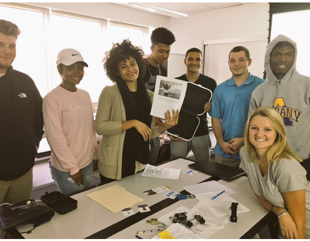
Figure 4. A successful team shows off their opened lock box.