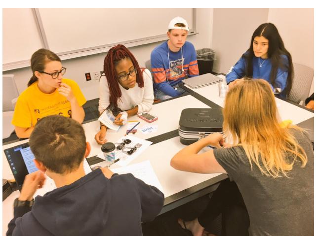
to work with Figure 2. Students work together to attempt a solution for a lock. entry with just

fully opened all five locks to open their boxes, revealing a picture of Damien, who they had successfully "freed" from the tunnels. All of the successful teams were down to the last minute, and one team gained three seconds