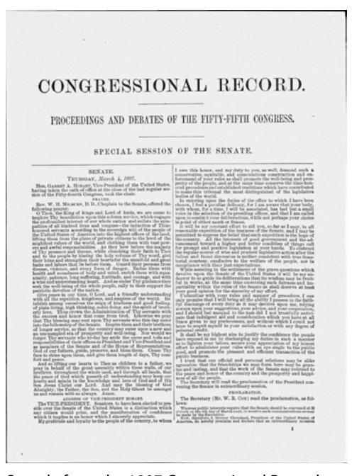
Sample from the 1897 Congressional Record.

ACRL Board of Directors is available at www.ala.org/acrl/resources/policies/chapter2.