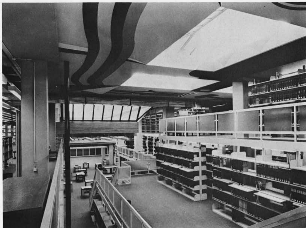
Library, University of Constance. Reading and Stack Area.

of centralized direction or budgeting. Library and other budgets are planned at the state level, not by the local university administration. In the State of Hesse a new law provides that the director of the university library is in charge of all libraries. In Schleswig-Holstein the law says that the libraries on a given campus constitute a single unit. But as stated by one library director, in the face of long-standing tradition one has to proceed very slowly. 5 On some campuses the faculty library committee attempts to achieve coordination through union catalogs or the consolidation of several small libraries into larger ones.