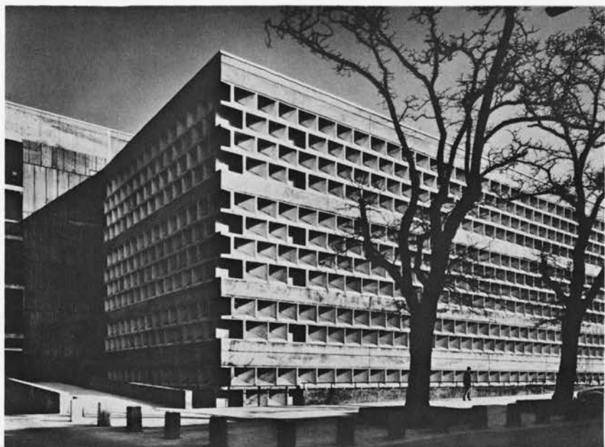
Library, University of Cologne. The Stack Wing.

The library at Karlsruhe is a thirteen-story narrow rectangular slab building of reinforced concrete. A dry moat brings daylight to the front basement of the building. Although pleasing to the eye, both inside and out, it is an architect's—not a librarian's—building. Because of a central core containing elevator shafts, stairway, and service desks, each public floor is divided into two parts; and they are connected by corridors.