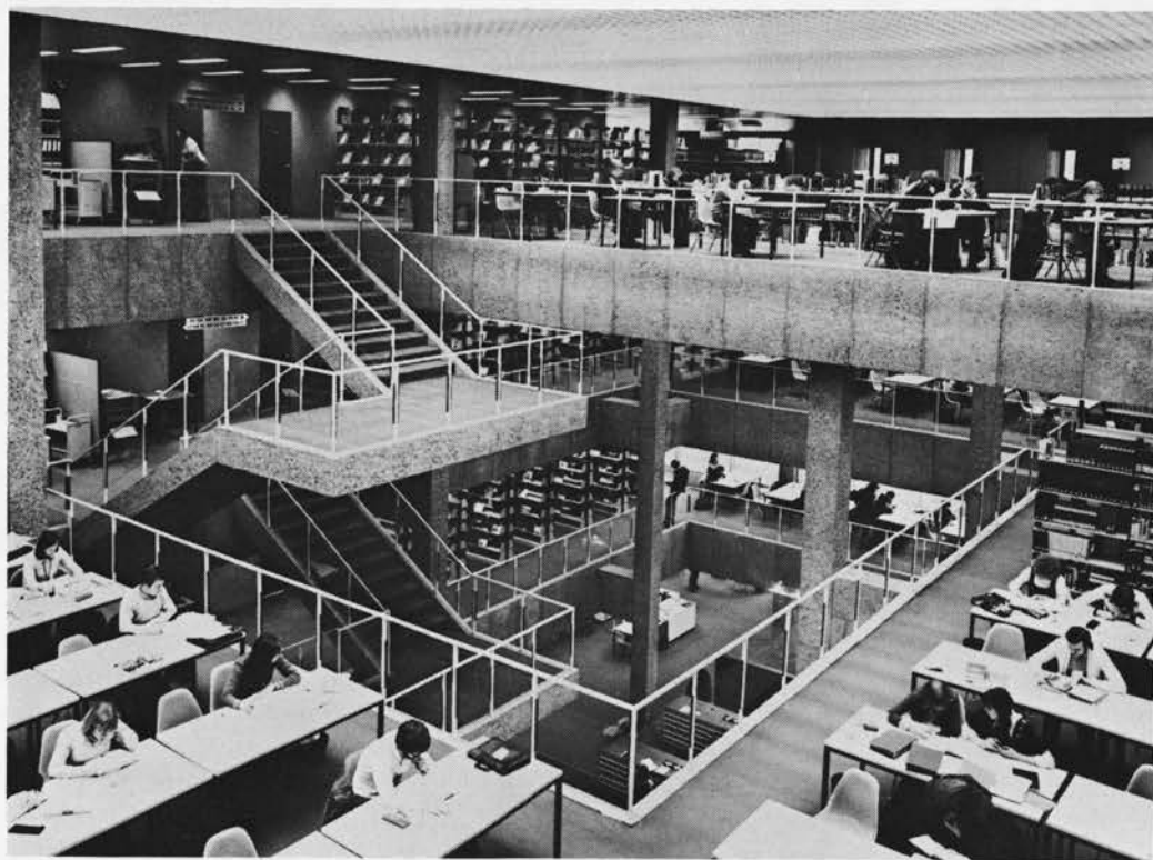
Library, Technical University of Braunschweig. Reading Area and Stairwell.