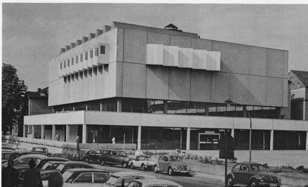
Library, Technical University of Braunschweig.