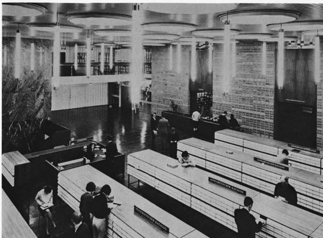
Library, University of Kiel. Public Catalog and Information Desk.

and faculty members. The Technical University of Munich, also on a busy street, expects to move to a new campus outside the city within twelve years. The library, with 300,000 volumes, now occupies the second floor and basement of a classroom and laboratory building.