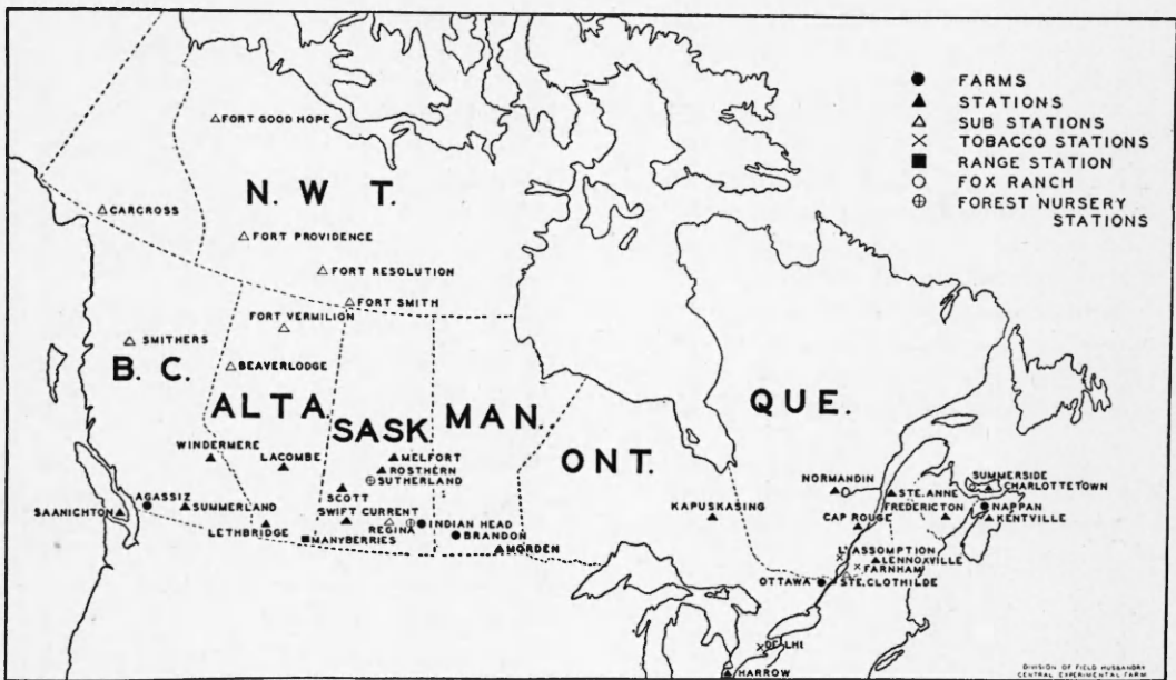
Taken from Fifty Years of Progress on Dominion Experimental Farms 1886-1936 , opposite p. 7.

tion. Coordinates work of Dominion and provincial field staffs.”