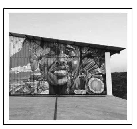
Keywords: Hispanic Caribbean, blackness, beauty standards, anti-black nationalism, racial identities, counternarratives

This article examines contemporary art of the Hispanic Caribbean as a counternarrative to the antiblack aesthetic ideals in the region. By exploring beauty standards on these islands through quotidian language and images that portray beauty, the proliferation of whiteness as the epitome of the aesthetic is exhibited in modern day Dominican Republic, Puerto Rico and Cuba. This article follows the work of scholars who have theorized and evidenced that the post-independence narrative has dominated the islands' perceived racial identities, marginalizing blackness and praising whiteness. We add that this discourse has also impacted its peoples' daily beauty rituals, as most of them facilitate the 'whitening' of one's appearance. Present-day art that extolls blackness and questions the exclusion of people of African descent on the islands thus serves as a powerful truth reveal; contrarily to the official history, negritude is not rebellion, rather it is the region's nature and beauty. In other words, this research seeks to explore how this art portrays negritude as the face of the Hispanic Caribbean, normalizing and celebrating the appearance of the majority of its people.