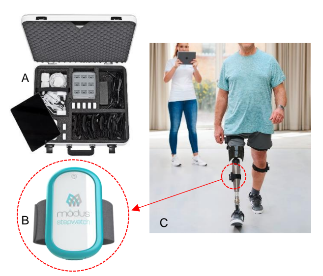
Figure 4: Real real-time sensors to aid in data capture, developed specifically for orthotics and prosthetics are used at Ability as part of daily clinical practice. A: Ottobock Bionic Pro; B:ModusTM StepWatch; C: Real-time, untethered gait analysis being carried out using the Bionic Pro and StepWatch. Persons in image have given informed consent to publication.

In early 2020, Ability consummated an investment from the world's largest prosthetics manufacturer, Ottobock Healthcare. Ability became a cornerstone in the newly formed business unit, Ottobock Patient Care, Together, we can now advance patient care standards in the US by first working to strengthen our practitioners use of evidence to make evidence-based and data-informed clinical decisions regarding treatment plan and component recommendation. We can leverage Ottobock's vast experience in P&O patient care around the world, product technologies, clinical research and reimbursement experience, growing amputee data lakes and existing Best Practices in the areas of lean facility design, scanning and fabrication, as well as quality assurance. We can accelerate data capture through realtime sensors and further automatic current processes. thereby bringing meaningful translation of the data; to bring those 'daily practice' efficiency gains to the practitioner, saving them time and providing a more individualized experience to the patient. (Figure 4)