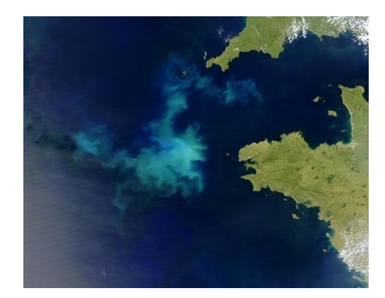
Figure 3 - Emiliania huxleyi bloom off the coast of France

In spite of the best efforts of Huxley to make the general public aware of diatoms, E. huxleyi and other diatoms remain largely absent from the public imagination. Perhaps it is because individually they exist at a microscopic scale where they can be easily overlooked and ignored. They do, however, also collectively form into large algae blooms that can be seen from space. Their silica based coccolith shells reflect sunlight creating huge swaths of aquamarine waters, swirls of color more associated with tropical seas than the North Atlantic. These massive algae blooms change the albedo of the water, transforming how much sunlight is reflected back. Clearly, diatoms have a large impact even if their net effect on the climate is not precisely known by scientists or acknowledged by the general public.