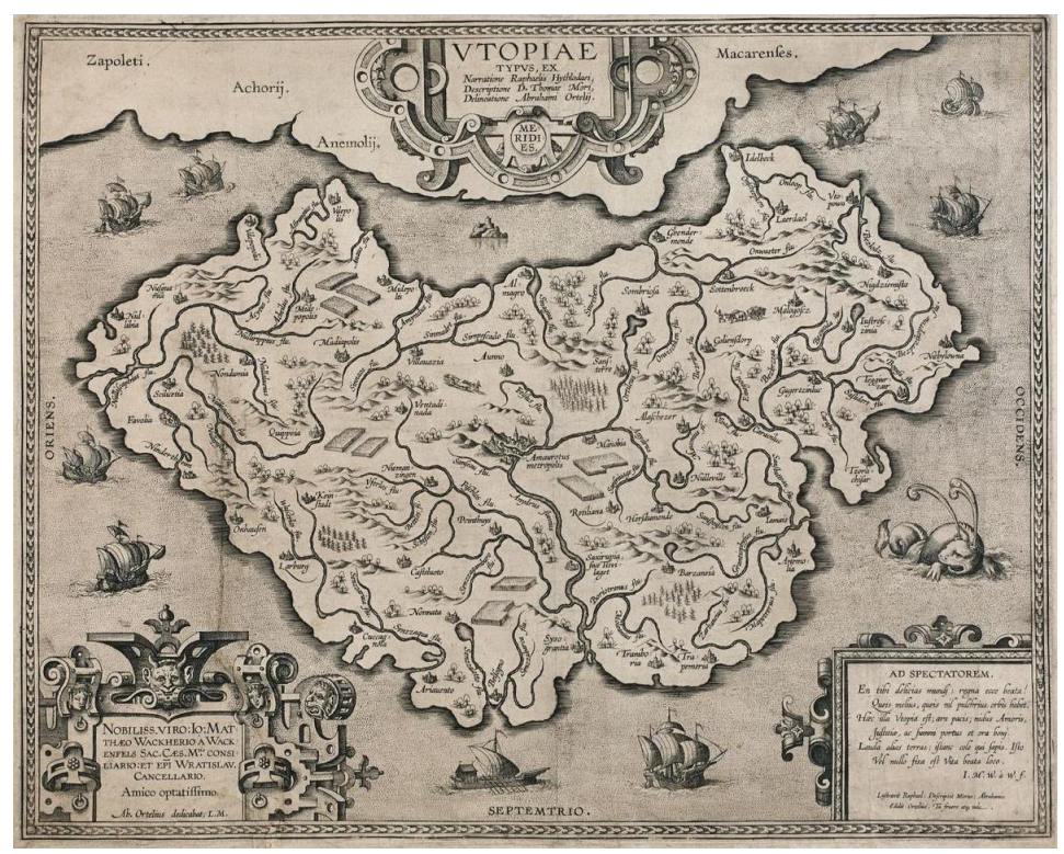
Figure 3. Abraham Ortelius' map of Thomas More's Utopia , ca. 1595.