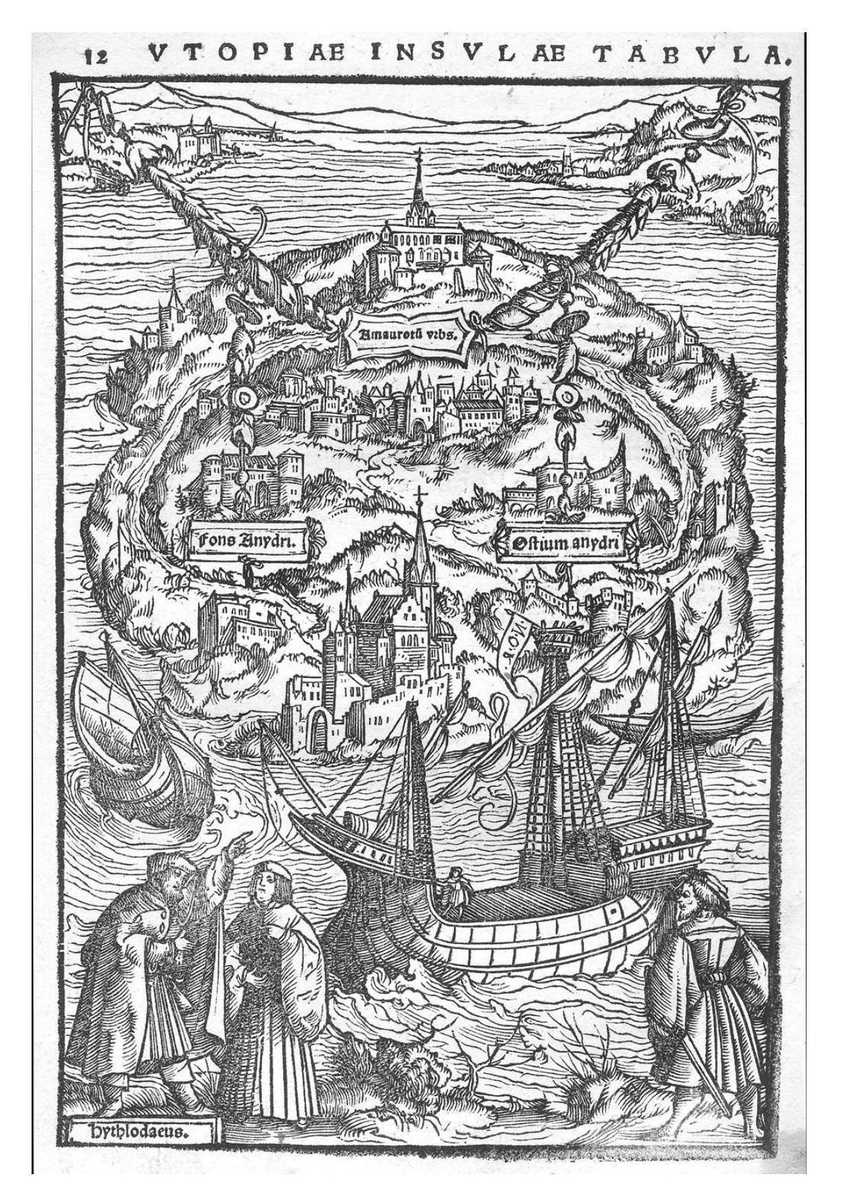
Figure 2. Ambrosius Holbein's map of Utopiae Insulae Tabula with Hythlodaeus pointing at the land, for the second edition of Thomas More's Utopia , 1518.