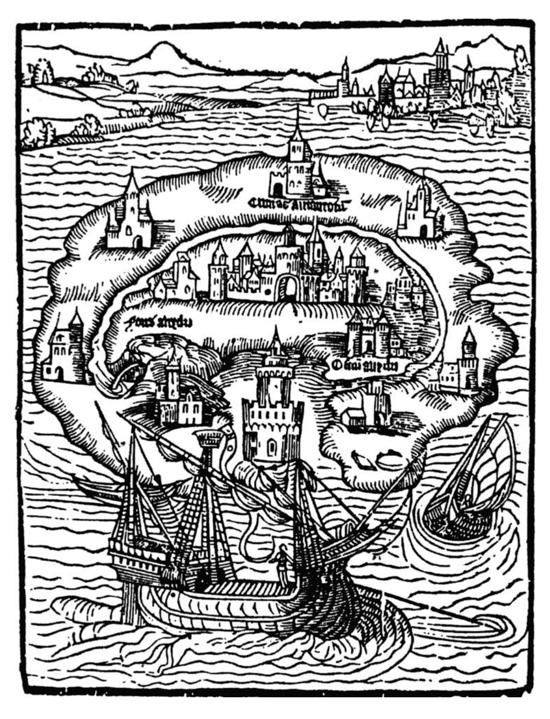
Figure 1. Ambrosius Holbein's map of Insulae Utopiae Figura , for the first edition of Thomas More's Utopia , 1516.

existed and re-creates it according to his will. And yet, in tracing its history back to the original act of rupture and violence, Utopus' nation is condemned to "the temporal paradox of utopia, which is that it both is, and cannot be , isolated from the contamination of the past" (Attewell, 2014, p. 49). This violent transition eventually exposes the dystopian origins of society, demystifying the immutability of the state and offering a glimpse of the potential dissidence among its citizens. Thus, the social and spatial insularity of Utopia, as well as certain misogynistic practices (Sargent, 1973, p. 304), turns this utopia into a dystopia (Serras, 2002).