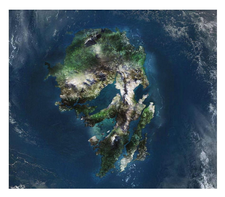
Figure 6 – Skull Island, from Kong: Skull Island (2017)

The expedition's motivation to test the Hollow Earth theory determines their initial interaction with the island as their helicopters drop seismic charges to aid their mapping activities. These also succeed in disturbing Kong and prompt him to attack the helicopters in order to defend the island. Much of the remainder of the film features combat scenes between giant creatures and with members of the expedition. Deprived of the final New York sequences key to the previous versions of the film, the conflict between man (specifically gendered, as Larson's character is one of only two females in the film) and