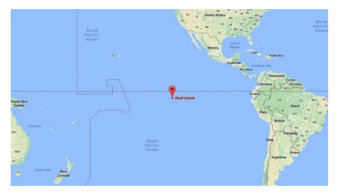
Figure 5 - Google Earth pin of the position of Skull Island, March 2017