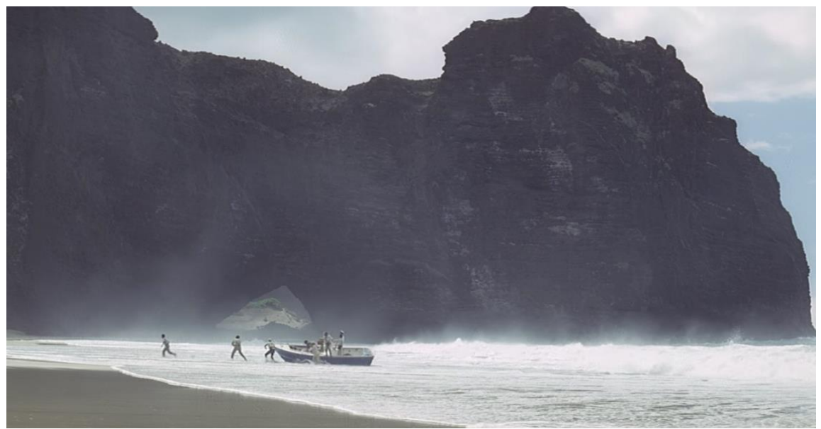
Figure 4 – The expeditionary party's first landing on the island from the 1986 version of King Kong .

Petrox to use for promotional purposes. As in the original, Kong dies atop an iconic New York skyscraper, in this case the World Trade Centre, where he is shot down by helicopter gunships. In many respects, the 1976 film simply replays key themes and scenarios from the original in a modern-day context, utilising Hawaiian locations to represent Skull Island in a more convincing manner than the 1933 film. The other principal difference, the introduction of a petroleum company as the disruptive influence that leads Kong to be captured, transported and killed, is a notable inflection but one that is not used to develop any environmental moral or critique (and, whatever the western agency involved, the outcome is the same).