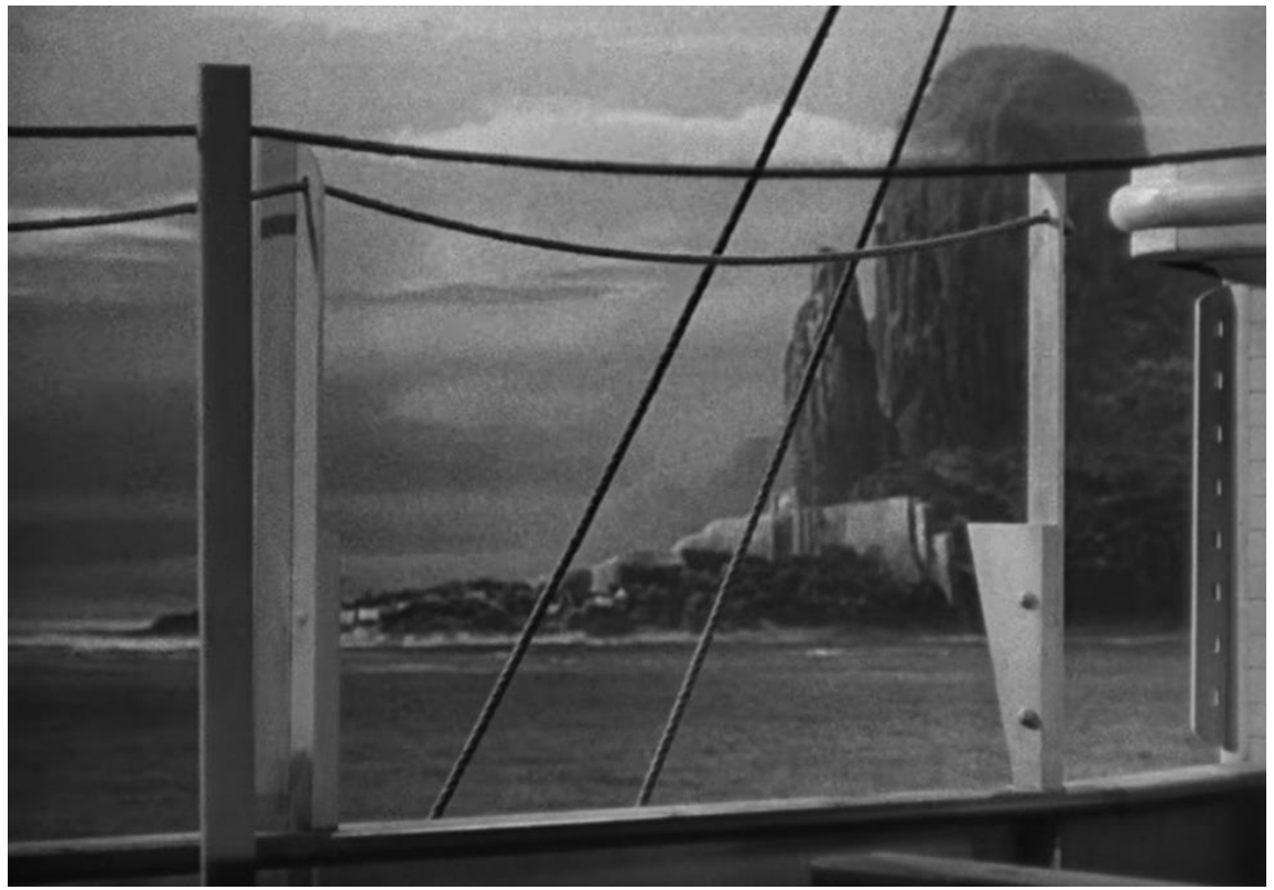
Figure 3. The western voyagers' first glimpse of the island (1933 version of King Kong)

weapons they are shown brandishing, their clothes and their face and body paint render them as a fairly arbitrary mash-up of African and Melanesian elements. The only clue given to their cultural origins/identity is that the ship's captain identifies their speech as sounding like Nias Islander speech (an Austronesian tongue) through which he manages to conduct basic communication with them.