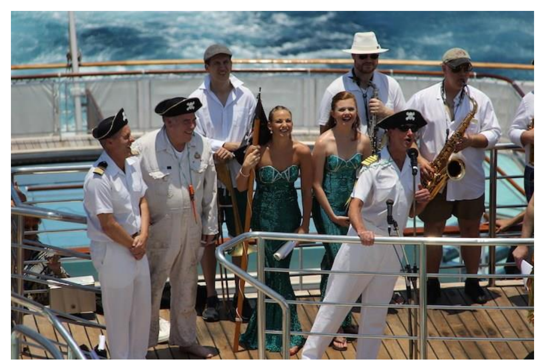
Figure 3: Mermaids, pirates, and musicians during a line-crossing ceremony.