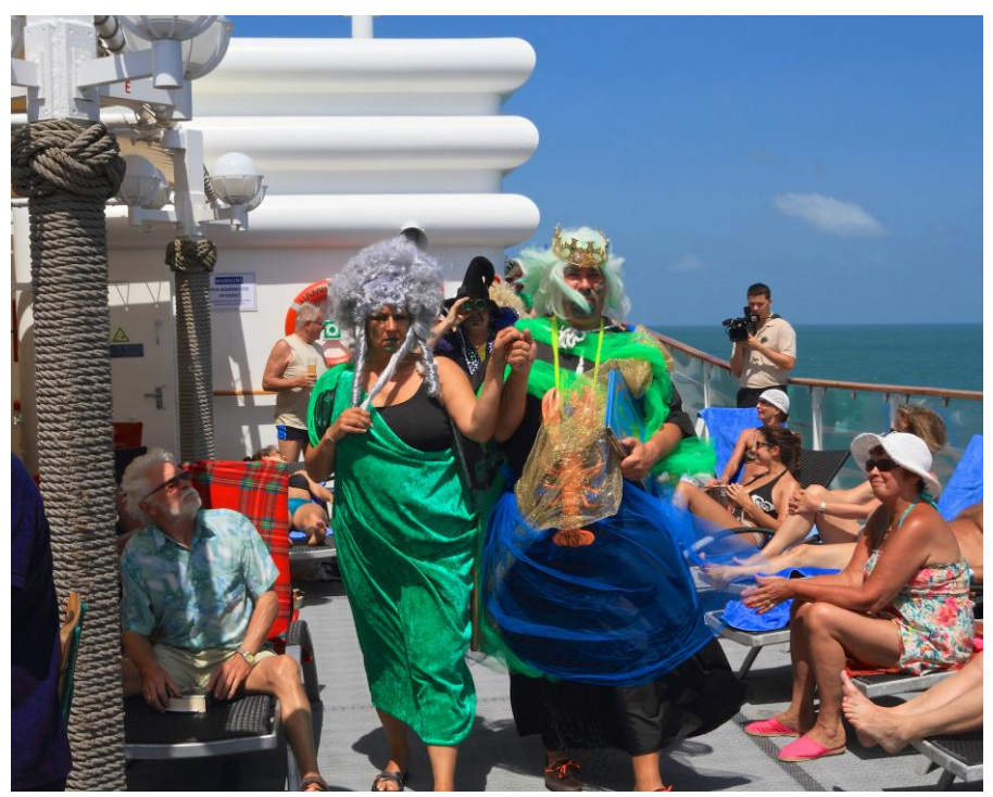
Figure 2: King Neptune and Queen Amphitrite arrive on a cruise ship for the line-crossing ceremony