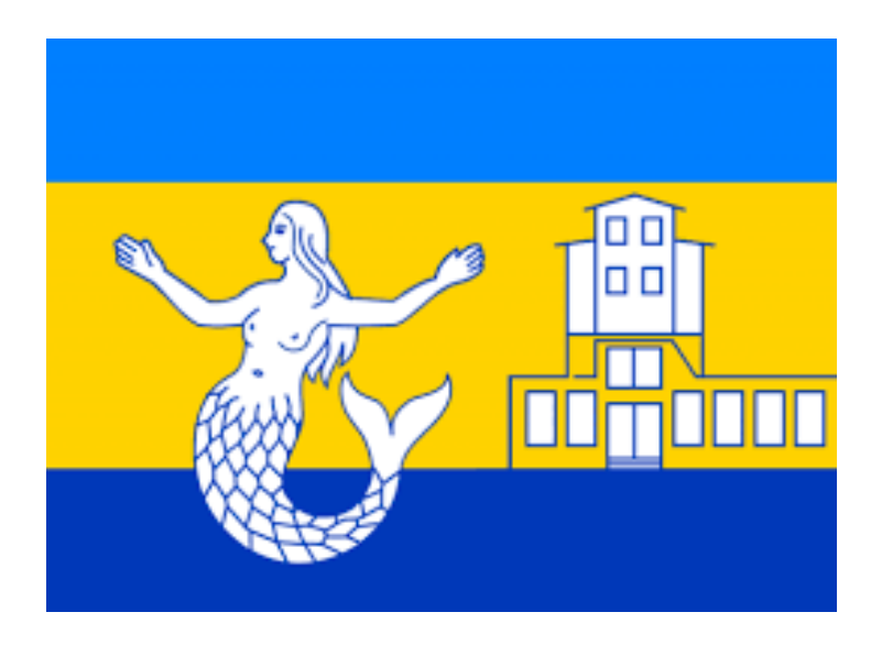
Figure 3 – Achzivland's official Flag

Taking another approach to the flag symbolism, Verveer has characterised the presence of the mermaid as: