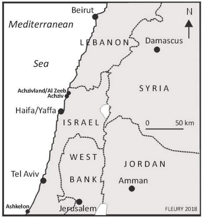
Figure 1 – Position of Achzivland within Israel and broader region (Christian Fleury, 2018)

While the far north-west of Palestine was identified as a Palestinian area under the United Nations plan, forces acting on behalf of the newly proclaimed state of Israel invaded the area in May 1948 in an initiative named Operation Ben-Ami. The coastal village of al-Zeeb, a settlement with a population of around 2,200 built on and around the historic site of Achziv (which its name is a variant of), was a major target on account of its serving as a regional centre for Palestinian resistance to Jewish settlement over the preceding decade (Zochrot, 2014). Israeli forces secured control over the village after the majority of its residents fled a mortar barrage. After detaining and removing the remaining residents, the village was razed to the ground in an act of retribution.<sup>4</sup> In the following year a kibbutz (communal settlement) was established in the area to house Jewish migrants from the United Kingdom, USA and South Africa and there has been no Palestinian repopulation of the village in subsequent decades.