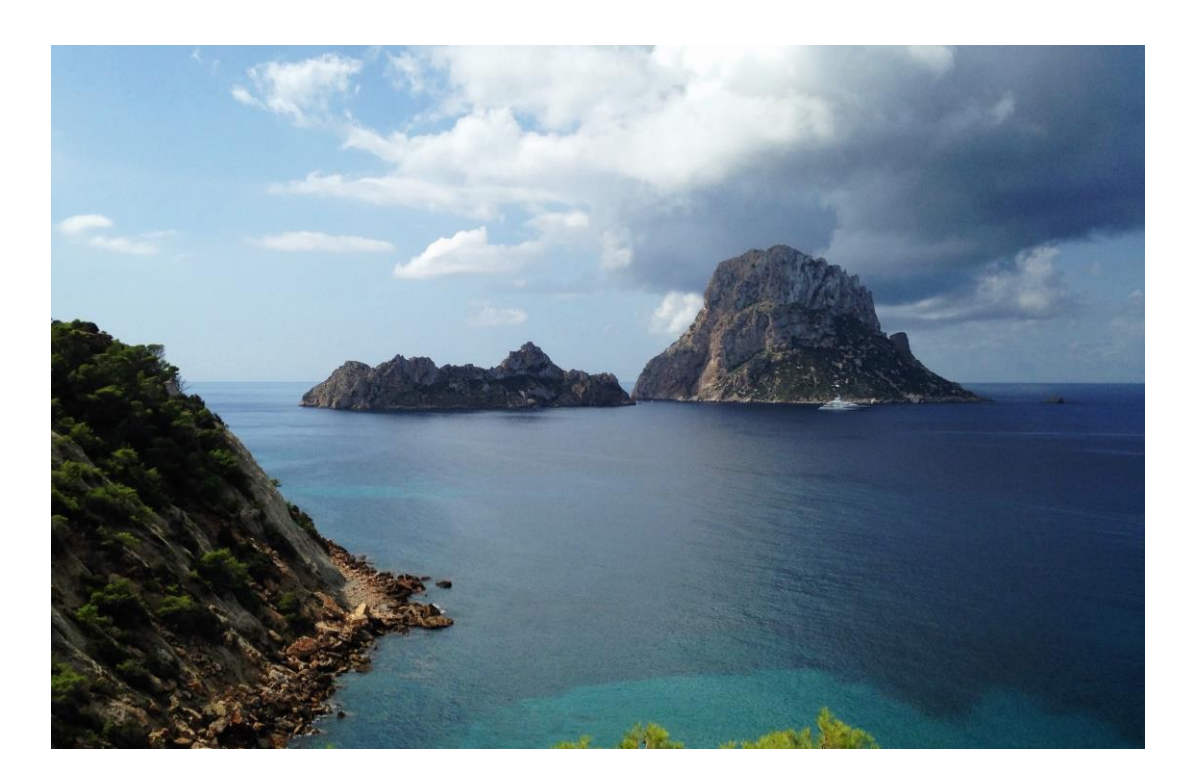
Figure 3: Es Vedrà (right) and Es Vedranell (left) viewed from cliffs on adjacent shoreline of south-western Ibiza.

The geographical alignment of the coastline and Es Vedrà allows viewers the experience of watching the sun set behind the island, an aspect that is frequently remarked upon by visitors and tourism promoters, e.g.: