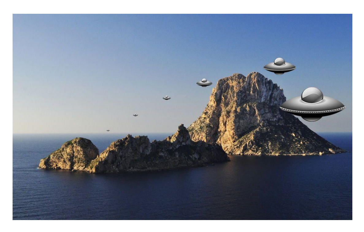
Figure 7: Digital image showing an artist's impression of UFOs flying around Es Vedrà

The two clusters of female imagery are often cross-associated, as in the following blog post, which places the island at the centre of two classical myths in a manner not suggested in any mainstream reference source: