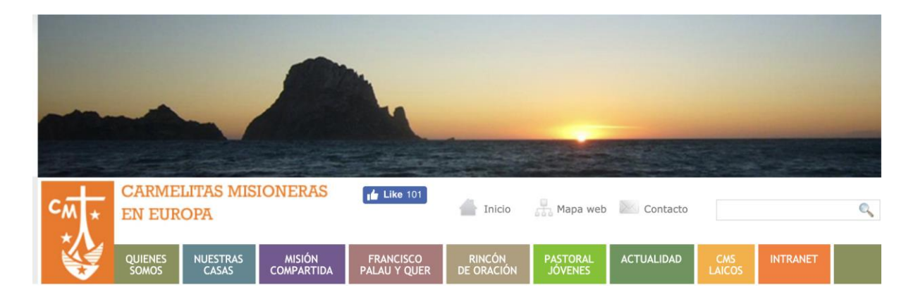
Figure 6: Image from main page of Carmelitas de Europa website (2019), showing Ibizan coast (far left) and Es Vedrà (centre left)