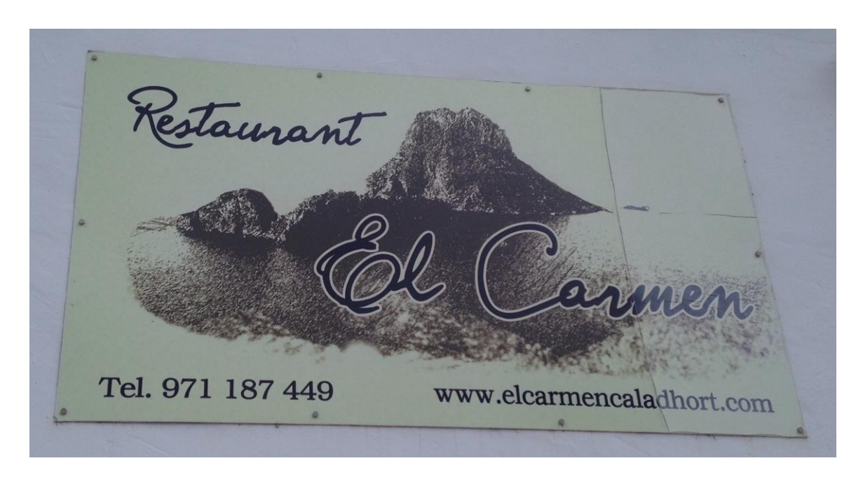
Figure 5: El Carmen restaurant sign, Cala D'Hort (Photograph by Philip Hayward, September 2018)