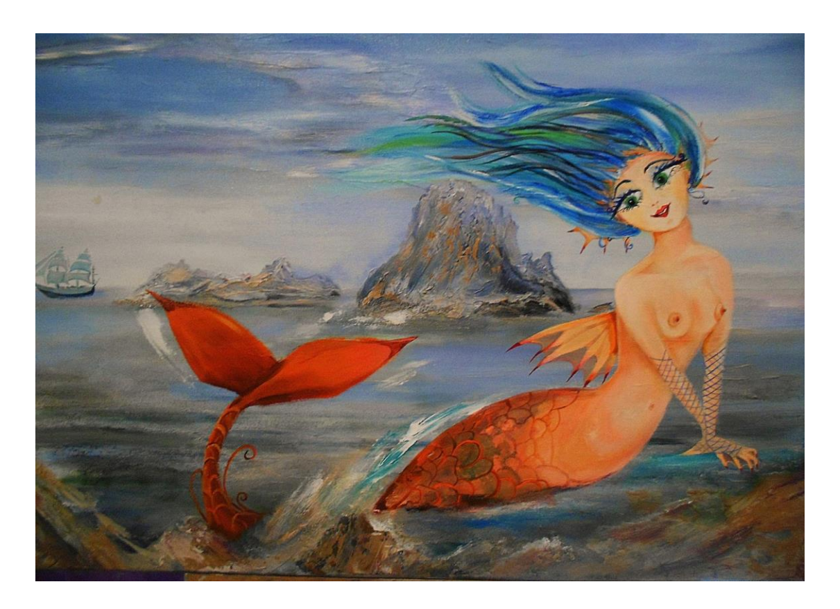
Figure 8: 'Sirena en Es Vedrà,' Cristina Prieto (2015?)