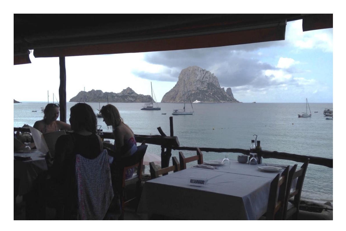
Figure 4: Es Vedranell and Es Vedrà viewed from inside the terrace area at El Carmen restaurant, Cala D'Hort (Photograph by Philip Hayward, September 2018)