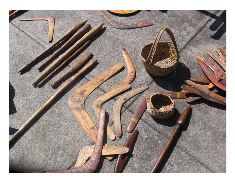
A collection of items being offered to the Museum. Photographer unknown.