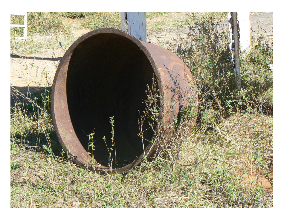
Stewpot from a former Queensland government reserve, now an independent community.

Is a boomerang an Indigenous object? Of course it is – as are the other articles in this photograph. When the Museum talks about collecting 'Indigenous objects' this is what people, both Indigenous and non-Indigenous, think they should offer. All of us have been caught in the trap created by non-Indigenous people of what is authentically 'Indigenous'.