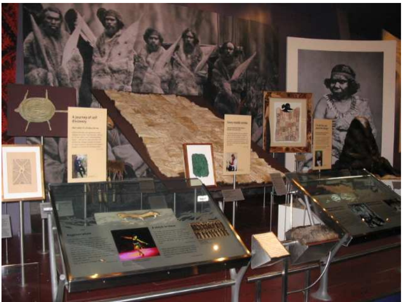
This image is of an exhibit on possum skin cloaks. The story told here is of two Victorian Aboriginal women who decided to recreate the craft of making the possum cloaks that were such an essential part of their Yorta Yorta and Gunditjmara communities' culture before occupation.

What difference does it make to the response Indigenous or non-Indigenous visitors? Some Indigenous people may feel more comfortable to visit the Museum because they feel they have a section where they 'belong' and can find stories that they feel as relevant to their lives. For some non-Indigenous visitors, it can mean they can avoid any history they do not want to engage with.