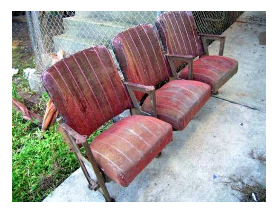
These are seats from the old Bowra Theatre, Bowraville, northern NSW. The seats were removed in the 1960s. They have recently come into the Museum's collection.

Is this stewpot an 'Indigenous' item? This giant stewpot was used at a large community in Queensland, once was a government institution, where people were incarcerated. This stewpot represents that period of incarceration – both the negative aspect – repression, police state policies – and the positive – the feeling of community that existed despite the repression, and also partly because of it.