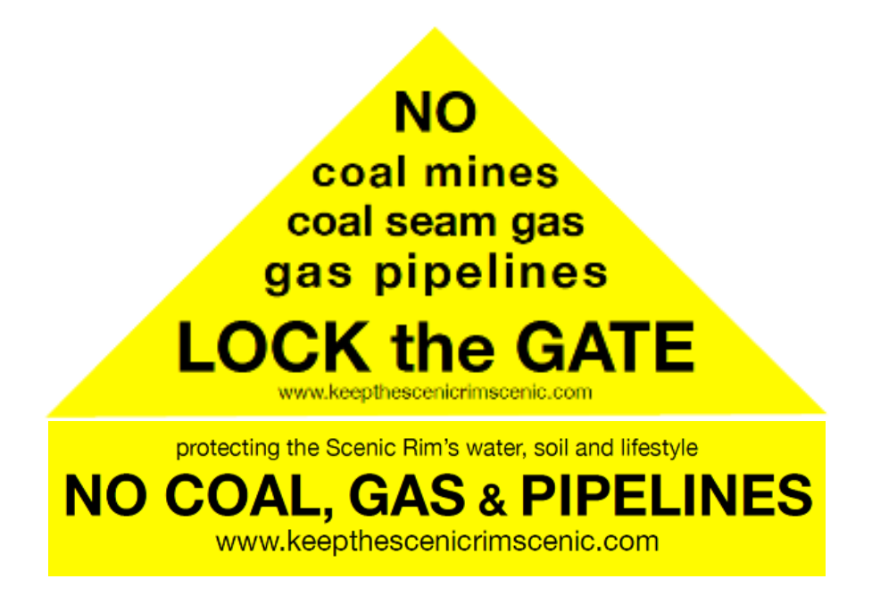
Figure 2: The Lock the Gate triangle, symbol of community protest against coal seam gas exploration and mining, along with related messages made available to the public for posting on property entrances.

After our protests, to Council, the well was blocked off, but we received notification [at a public meeting] that they would be returning in 2013 for the next phase of production. They said to us, "we're not breaking the law, this is the law." ... One chap up the road says he will shoot them if they try to come on his property, and the scary thing is that he might!