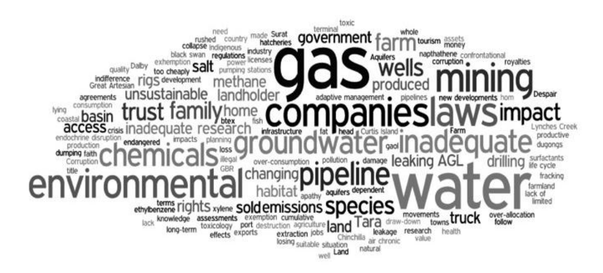
Figure 8: Summary of interviewee concerns, based on a Wordle analysis of the interview transcripts (Friedman, 2011), in which the larger the word, the more times that the word was used by interviewees. This illustrates the common themes of concern expressed in the interviews.

The issue that surrounds the focus of this study spans the rights to land and water, an issue that appears to reach from the heart of communities towards questioning the foundation and nature of the capitalist system. This focus appears, however, to draw of other more tangible and directly relevant internal and external factors, such as social disadvantage of the region, tensions between what is acceptable resource use, land tenure and access, environmental awareness and patterns in the region, and dynamics between different local and regional social groups. Such external factors need to be considered in contextualising the complex views, beliefs and emotions expressed by the participants in this study. The concerns recorded here, and expressed in various ways, appear to reflect people's fears that their basic human needs – whether expressed in terms of social capital, a future for their children, land rights or environmental quality – may not being met in the future. While the evidence records immediate responses, and may be considered to represent short-term reactions of people (on all sides of the issue) on the run in the immediacy of an event, they provide an interesting example of how social tensions can readily rise, be reinforced, and become drivers of behaviour. Nevertheless, the evidence for public expression of emotion and conflict indicates the potentially significant psychological and social effects emerging from this issue.