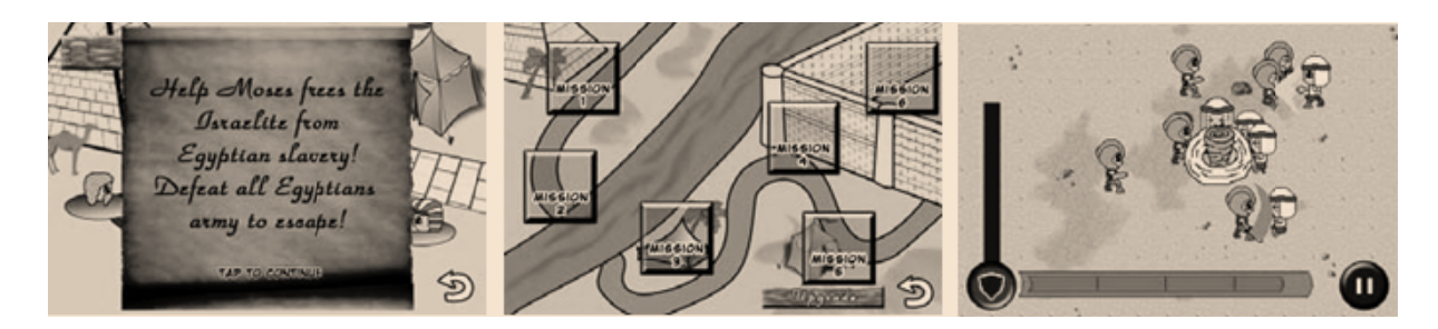
Figure 3 Moses Game (Source: Chowanda et al. , 2015)

other characters such as Mpu Gandring, Kebo Ijo, Tunggul Ametung, Anusapati and Penghuni Hutan. The comprehensive details of the game can be read at (Chowanda & Prasetio, 2012).