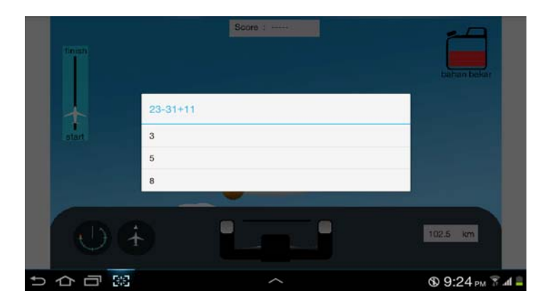
Figure 5 Case-Gameplay Screen

In figure 5, the user will see the coins and fuel appeared among the clouds along the way. Users are required to answer questions that will arise after the user take coins or fuel before taking into scores for coins or fuel to provide additional power until the aircraft reaches the destination airport. An incorrect answer will disappear from the answer choices, so the user is directed to the correct answer choice.