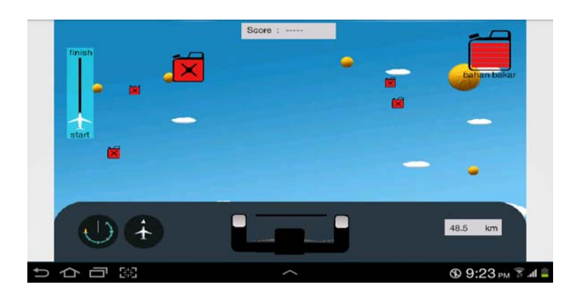
Figure 4 Gameplay Screen

In figure 3, the screen will display the high score of five highest score ever achieved by the users during play in this game. Users will see their names on the right side. Users will be asked to input their names when they reach the new highest score in each level.