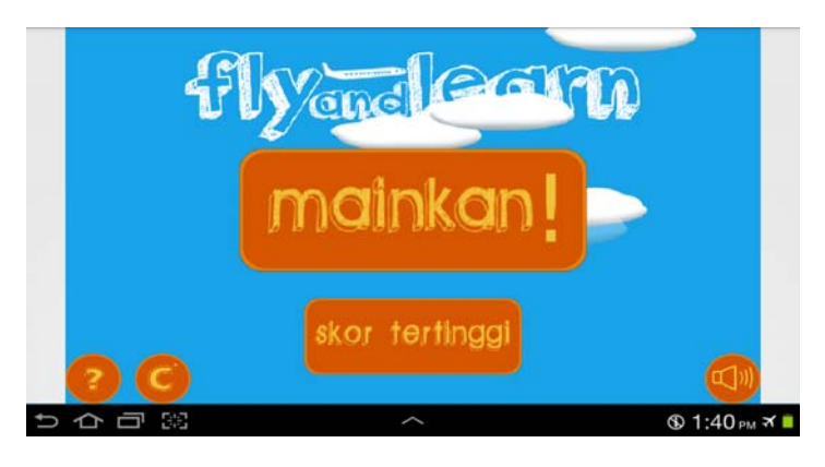
Figure 2 Main Menu Screen