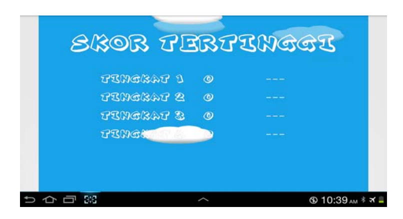
Figure 3 Highest Score Screen

Main menu screen will be displayed after the display screen is completed. On this screen, there is the title of the game: Fly and Learn, as well as five menus that can be accessed by the user, i.e. play! tutorial, the highest score, sound settings, exit. Play! button will bring the user to start the game, the highest scores will display four user listings. The tutorial button will show display screens that describe the user interface in the game. Sound settings button is to turn on and turn off the sound in the game. The function of exit button is to exit from the game as it can be seen in the figure 2.