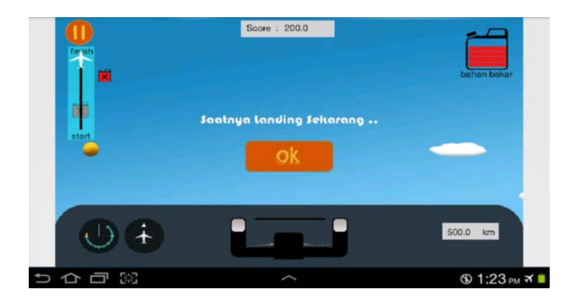
Figure 6 Initiation Landing Screen

In figure 5, the user will see the coins and fuel appeared among the clouds along the way. Users are required to answer questions that will arise after the user take coins or fuel before taking into scores for coins or fuel to provide additional power until the aircraft reaches the destination airport. An incorrect answer will disappear from the answer choices, so the user is directed to the correct answer choice.