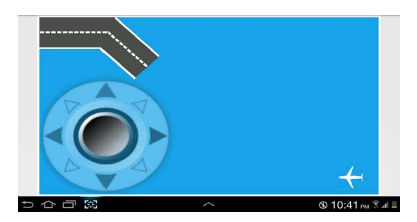
Figure 7 Landing Navigation Screen