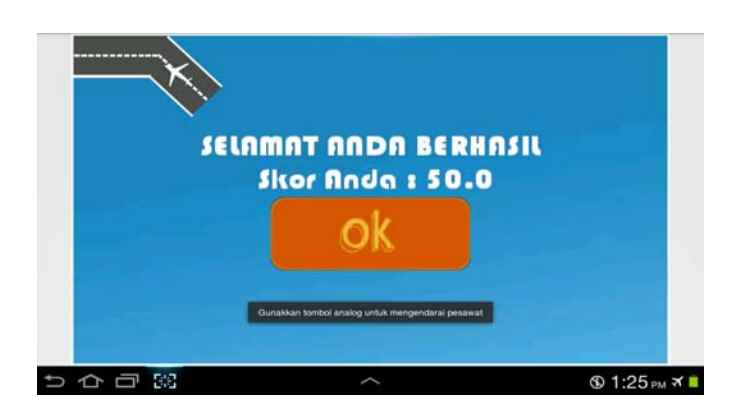
Figure 8 Landing Navigation Screen

The screen above is the display screen before entering into landing mode. During the arrival time of landing, the system will provide notification to the user and if the user successfully lands the aircraft, the system also gives notice to the user that success and showed obtained scores.