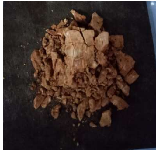
Figure 9. Red bricks after testing were destroyed