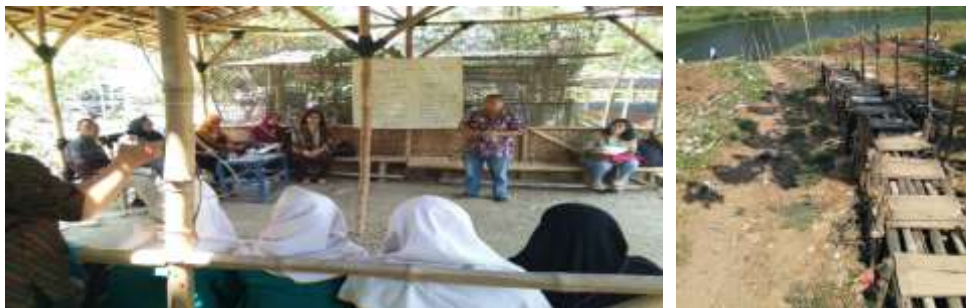
Figure 1. Survey of Citarum watershed conditions

The method used in this study was a literature review with observations and test materials in the Pancasila University Concrete Laboratory. The field survey was conducted prior to the implementation of the socialization (Figure 1).