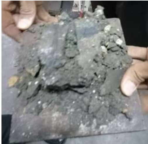
Figure 8. Concrete bricks after the test were destroyed

From the results of testing shows eco-bricks has a higher compressive strength when compared with red bricks and concrete bricks. After a strong test of the test specimen, a successful failure of each test object was seen, shown in Figure 8,9 and 10.