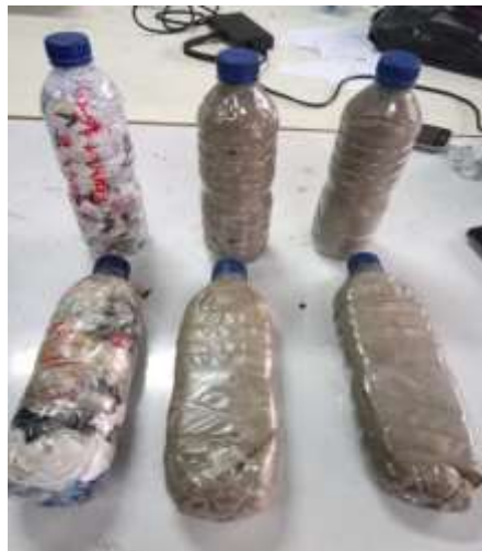
Figure 10. Eco-bricks after testing are not being destroyed

From Figure 8,9 and 10 shows that eco-bricks are stronger in accepting the burden when compared to other materials. If eco-bricks are applied to non-structural, eco-bricks is able to withstand greater load, in this case earthquake, because when an earthquake occurs structural/non-structural damage that is destroyed can injure humans.