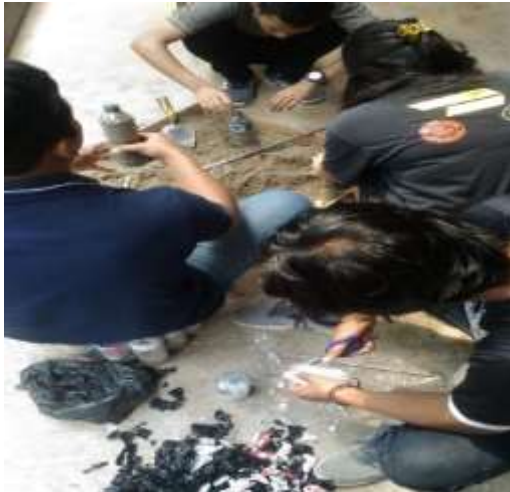
Figure 4. Making eco-bricks

paper and food scraps that will break down, and the last It is very important to ensure the quality of the eco-bricks made. Weigh eco-bricks that have been made, eco-bricks are good if they weigh at least 35% of the volume of the bottle. In a 1500 ml bottle, the minimum weight is 500 grams, in a 600 ml bottle, the minimum weight is 200 grams. In Table 4 is the weight of the eco-bricks made (Figure 5).