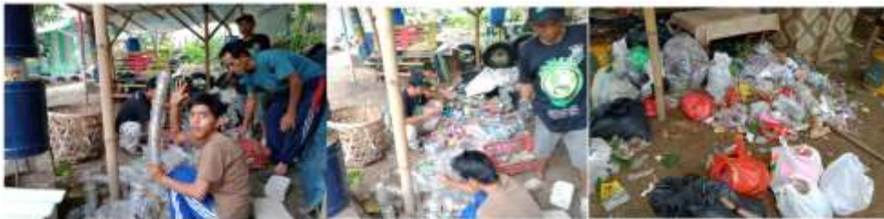
Figure 2. waste sorting process in the community

problem that occurs in the lower part of the Citarum River, especially in the Karawang district, there are no landfills at several points, so that people throw their garbage carelessly, including into rivers. The Ecovillage community consists of 15 RWs with approximately 20 members, which are active communities in collecting organic and inorganic waste in the community (Figure 2). However, the problem is the lack of knowledge from ecovillage members in recycling waste. One solution in this problem is by utilizing plastic waste that cannot be recycled as sustainable construction materials [14][15]. In making eco-bricks, before testing the materials are prepared to make eco-bricks with various predetermined variations. The steps to make an eco-bricks can be seen in Figure 3.