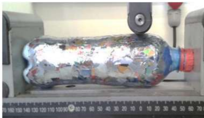
Figure 5. Position when performing the compressive strength test [13]

The results of the compressive strength test on the Eco-bricks that have been made, when testing the position of the test object must be in a sleep state because for eco-bricks application in the field, the position used in the sleeping position is not the standing position [14].