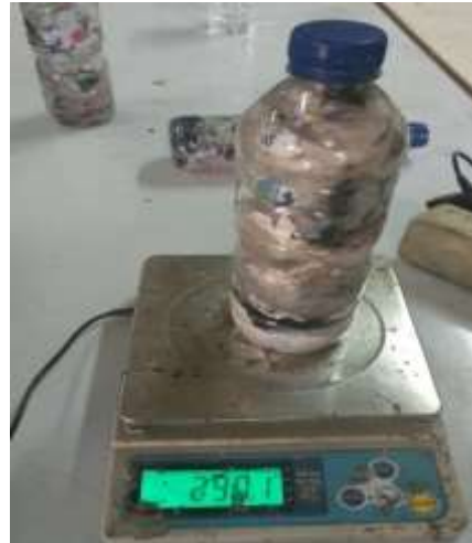
Figure 5. measuring Specimen weight