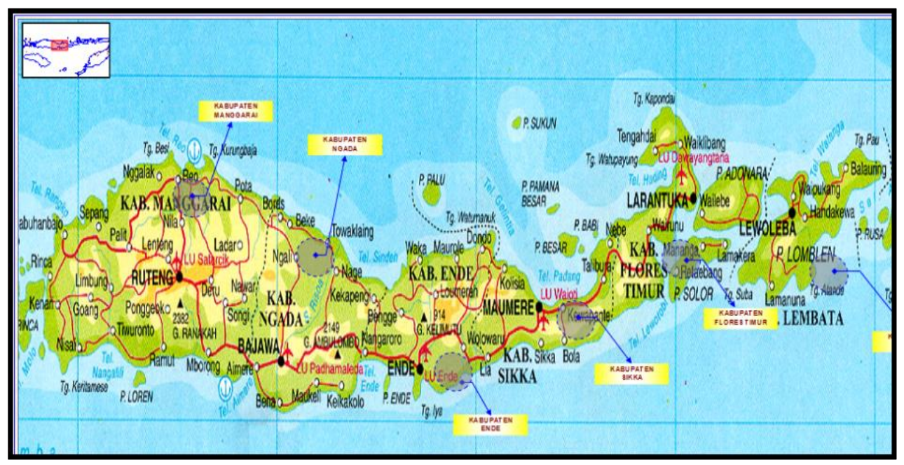
Figure 2. Layout of Flores Island in East Nusa Tenggara