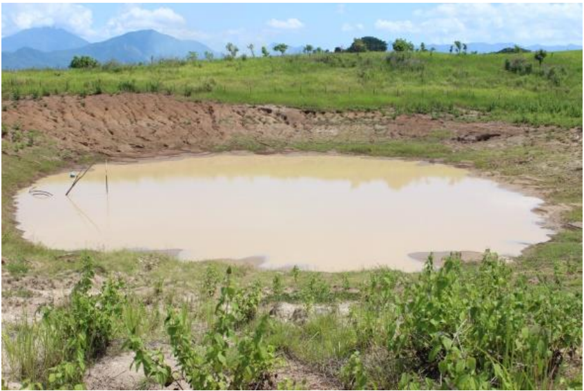
Figure 1. The retention pond in Larantuka - Flores Island

Surface runoff occurs when the rainfall is greater than the ability of the soil to absorb water. So that the excess water flows down to the river, lake, or sea. One indicator that determines the amount of surface runoff is the value of runoff coefficient. The runoff coefficient is mentioned "high" when it close to 1.00, which indicates that more rainwater becomes the surface runoff. But if the rainwater percolate as infiltration to underground then the runoff coefficient is close to 0.