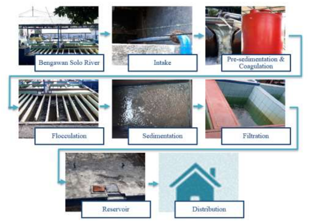
Figure 1. Flow Chart of River Water Treatment to Drinking Water

The sedimentation basin consists of 2 parts, namely the settling basin and the settler bath. The use of settlers aims to help settle small flocks to not carry over to the following process [8]. The type of settler used is a tube settler. The sediment in the sedimentation basin is in the form of sludge, also known as production waste. Kajen WTP uses a rapid sand filter type of filtration with three media: quartz sand, gravel, and a filtering membrane. The filtering media's replacement is carried out for 2-3 years to maximize the filtering results.