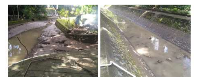
Figure 3. Bindu River Ecotourism Problems

Although it has great tourism potential, currently the Bindu River still has several problems, such as the existence of riverbank areas that have not been properly managed so that when the water rises during heavy rains, the risk of flooding will be even greater coupled with sediment shipments from upstream parts of the river, which causes siltation of the Bindu River thereby reducing the river's storage capacity (Figure 3). If the development of Bindu River ecotourism is not managed properly, the development of the Bindu River as ecotourism can threaten the sustainability of the Bindu River ecosystem.