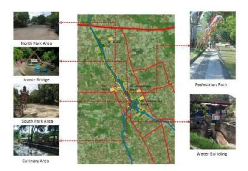
Figure 2. The Existing Condition of the Bindu River Ecotourism Area

The length of the Bindu River watershed is \pm 1300 m, with an area of \pm 22,100 m<sup>2</sup>. Bindu River is located in East Denpasar District, Kesiman Village. It consists of several banjars, namely: Banjar Dukuh, Banjar Ujung, Banjar Abianangka Kaja and Banjar Abianangka Kelod (Figure 2). Currently, the Bindu River has been managed and developed as an ecotourism area. The Ecotourism Society defines it as responsible travel to natural areas that conserves the environment and improves the well-being of local people. A walk in the rainforest is not ecotourism unless the trip benefits the environment and the people who live there. A rafting trip is only ecotourism if it raises awareness and funds to help protect watersheds. A loose interpretation of this definition allows many companies to promote themselves as something they are not [5].