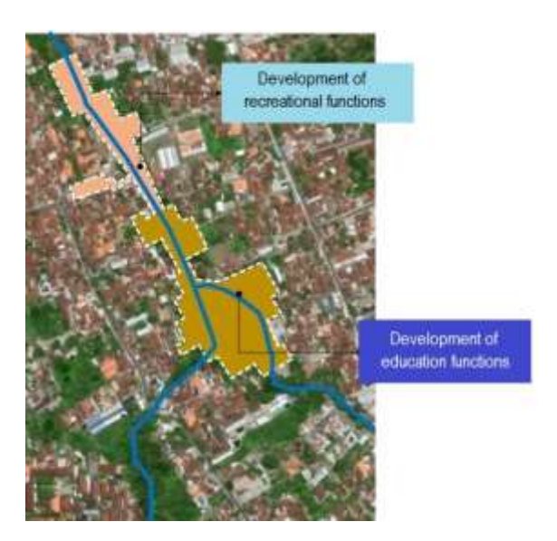
Figure 7. Recreation Zone Development

The recreation zone can also be developed into several more zones. The upstream part of the recreation zone can be developed into a recreation function development zone where at this location several development activities such as water recreation facilities and culinary facilities can be carried out. Meanwhile, downstream of the recreation zone can be developed into a zone for the development of educational functions by carrying out several fish hatchery activities, agriculture, outbound, creative business training, art training, co-working space, and water galleries. Recreation zone in Bindu River Ecotourism can be seen at Figure 7.