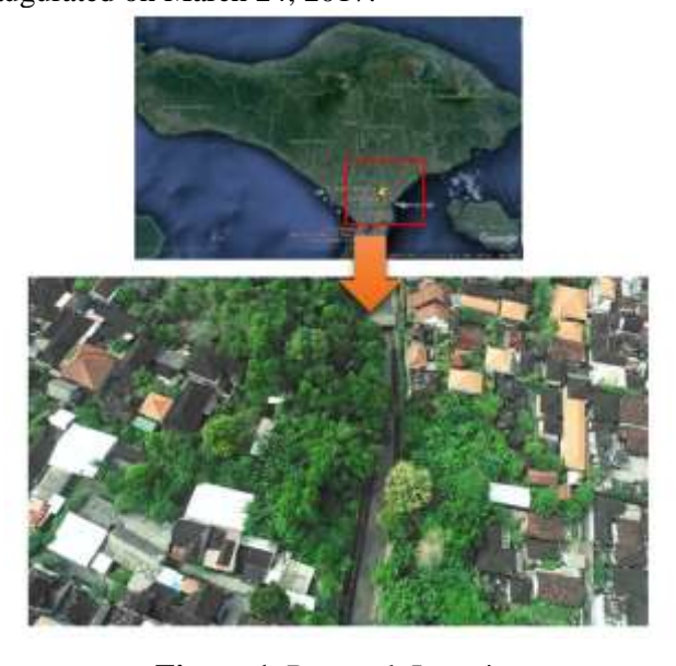
Figure 1. Research Location

This research was conducted at the Bindu River Ecotourism located in Banjar Ujung, Kesiman Village, East Denpasar District, Denpasar City (Figure 1). Bindu River is an ecotourism-based tourism object which was just inaugurated on March 24, 2017.