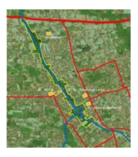
Figure 4. Bindu River Ecotourism Area Delineation

The determination of the delineation of the area is based on the length of the existing development segment that has been previously determined, the physical condition of the environment, and the administrative boundaries of the Banjar or environmental scale. Based on these considerations, delineation of the area is determined, as shown in Figure 4.