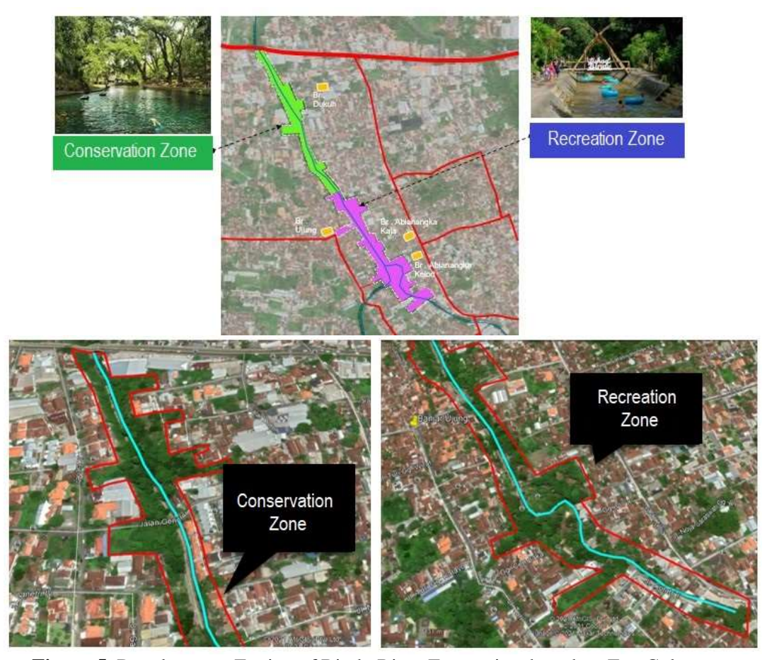
Figure 5. Development Zoning of Bindu River Ecotourism based on Eco Culture

Several studies confirm the importance of ecotourism for biodiversity conservation [10][11][12]. So in the development of the Bindu River Ecotourism area, it is necessary to pay attention to the concept of sustainability. Therefore, based on its potential, the Bindu River ecotourism area is divided into two zones, namely the conservation zone and the recreation zone (Figure 5). A conservation zone is an area designated for the preservation and protection of water, flora, and fauna. While the recreation zone is an area designated for utilization through the development of recreational and educational activities.