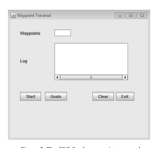
Figure 2. The GUI for the waypoint traversal application.

Having initiated goal execution, all three vignettes require the ability to suspend and resume goal execution (R1 and R5). Furthermore, both humans (V1) and agents (V3) need to be able to initiate goal suspension. In this regard, when a goal execution is initiated via the Start button in Figure 2, a GUI for the management of that particular goal execution is created, as in Figure 3. Each goal execution has a separate GUI that is bound to its execution object.