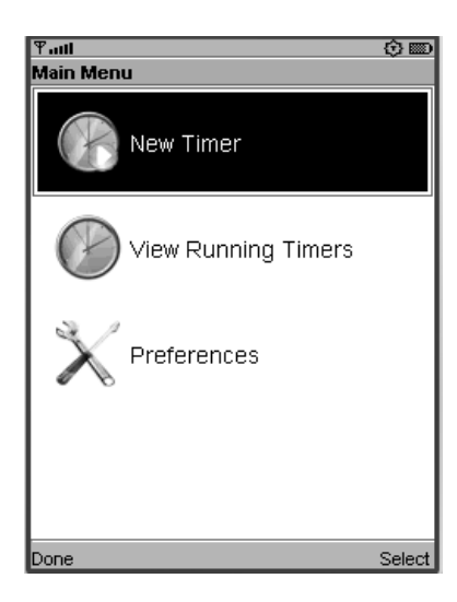
Figure 2. Main menu of application produced by designer B.