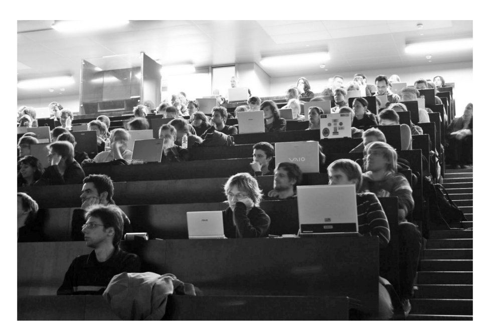
Figure 3. Picture of lecture room.

Due to the fact that different communication channels had been offered, students were very busy during the whole lecture. Based on video observation during the whole lecture and the