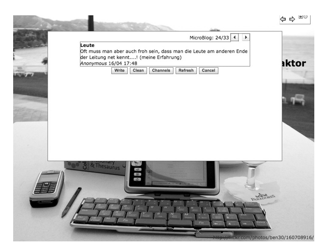
Figure 2. Typical Micro-blog annotation.

course is a compulsory one for BSc students of Electrical Engineering and Informatics and strives to develop a critical view on the way informatics influences modern society. Each year more than 200 students attend this course, following lectures on different topics like human computer interaction, eHealth, search engines, Weblogs as well as virtual worlds and informatics for different research fields.