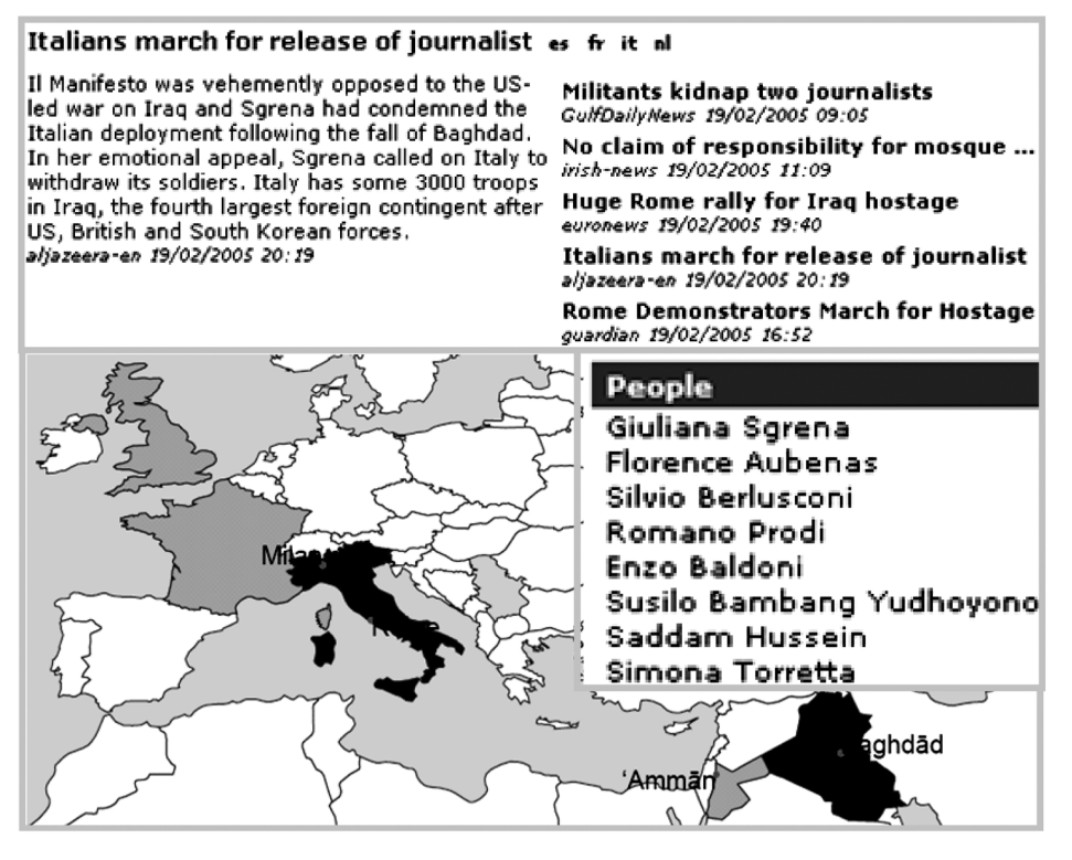
Fig. 1. English news cluster consisting of 5 documents, widh automatically identified links to related news clusters in Spanish, French, Italian and Dutch. Hyperlinks on the titles allow users to read the individual articles; links on names allow them to find out more about the persons, about all news articles in which they are mentioned, etc.

coverage of the articles in this cluster. By moving the mouse over a country or place name, the occurrences of the name are shown in their context (see Fig. 2).