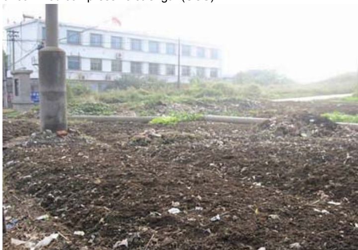
Figure 1: Construction of contaminated soil at site in a city

In solidifying the contaminated soil, the fly ash-cement curing agent has certain application value. This paper uses the man-made contaminated soil as the research object to explore the impact of cement, fly ash and gypsum on the strength of the contaminated soil. It also investigates the curing age of curing agent based on unconfined compressive strength (UCS).