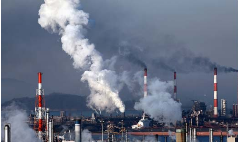
Figure 2: A typical chemical enterprise