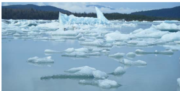
Figure 1: The melting glaciers caused by greenhouse gases

Chemical industry is mainstay industry in the development of economy and society and thus will influence the daily life of people. However, it also makes more contributions to energy consumption and greenhouse gases. China is the one of the largest countries producing chemical products all over the world. More importantly, the production of chemical industry in China is not very reasonable, where products with high energy consumption, crude processing, low additional value widely exist. The melting glaciers caused by greenhouse gases are demonstrated in Figure 1.