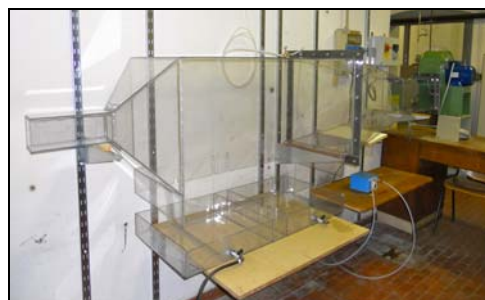
Figure 2. The experimental apparatus